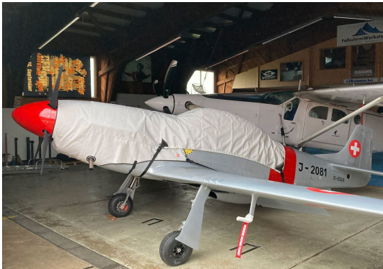
SW-51 Mustang Canopy & Engine Covers

Covers developed this material combination especially for aircraft protection. The outer material is medium weight and treated for water resistance, UV resistance and anti-static buildup. The inner lining is a very soft and smooth microfiber to prevent scratching. The material is very reflective, and tests show that the cabin interior temperature can be reduced to near-ambient temperature on the hottest of days. It is water, ice and snow repellent, yet breathable to allow moisture to escape from between the cover and the aircraft surface.