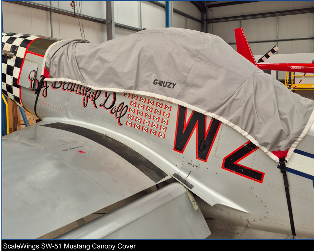
ScaleWings SW-51 Mustang Canopy Cover