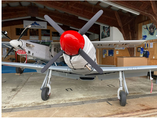
SW-51 Mustang Engine Cover

Covers developed this material combination especially for aircraft protection. The outer material is medium weight and treated for water resistance, UV resistance and anti-static buildup. The inner lining is a very soft and smooth microfiber to prevent scratching. The material is very reflective, and tests show that the cabin interior temperature can be reduced to near-ambient temperature on the hottest of days. It is water, ice and snow repellent, yet breathable to allow moisture to escape from between the cover and the aircraft surface.