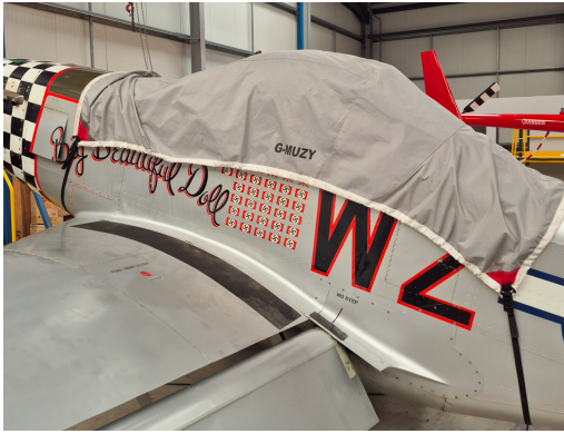
ScaleWings SW-51 Mustang Canopy Cover

the hottest of days. It is water, ice and snow repellent, yet breathable to allow moisture to escape from between the cover and the aircraft surface.