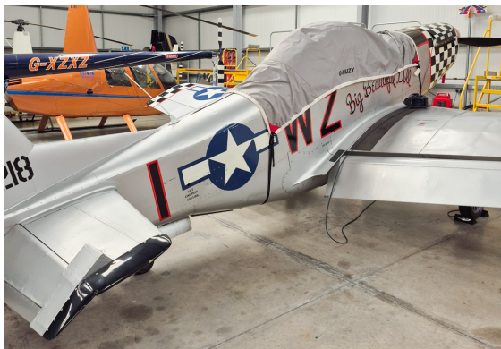
ScaleWings SW-51 Mustang Canopy Cover

the hottest of days. It is water, ice and snow repellent, yet breathable to allow moisture to escape from between the cover and the aircraft surface.