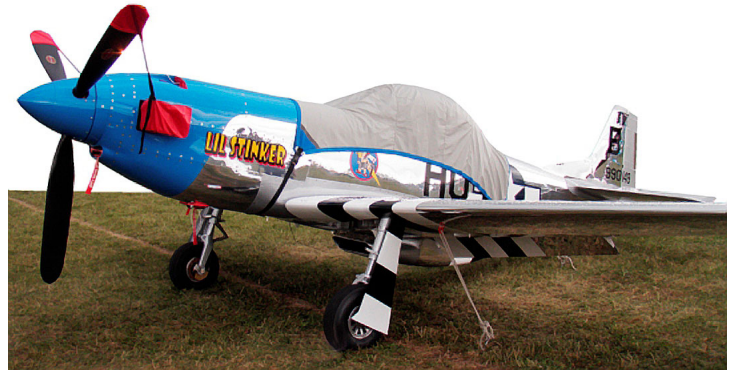
Stewart Mustang Canopy Cover, Prop Tie Downs & Intake Plugs