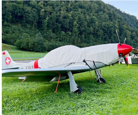
Stewart S-51 Canopy & Engine Covers

This cover type is made from Silver Acrylic Sunbrella canvas and is 100% lined with a soft and smooth microfiber. Bruce's Custom Covers developed this material combination especially for aircraft protection. The outer material is medium weight and treated for water resistance, UV resistance and anti-static buildup. The inner lining is a very soft and smooth microfiber to prevent scratching. The material is very reflective, and tests show that the cabin interior temperature can be reduced to near-ambient temperature on the hottest of days. It is water, ice and snow repellent, yet breathable to allow moisture to escape from between the cover and the aircraft surface.