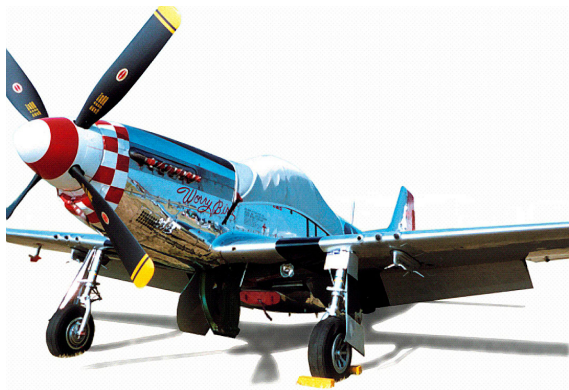
Canopy Cover, Belly & Chin Scoop Plugs