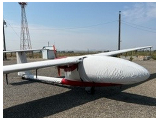
SZD-45 Ogar Canopy/Nose, Wings & Empennage Covers