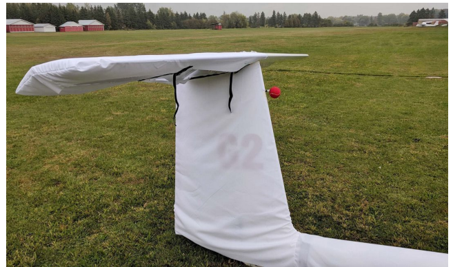
SZD Jantar Empennage Cover Set, test fit covers