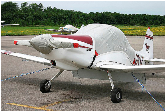
Bushby Mustang Canopy cover and Propellor/Spinner cover