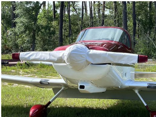
Mustang 2 Prop/Spinner Cover

This cover type is made from Silver Acrylic Sunbrella canvas and is 100% lined with a soft and smooth microfiber. Bruce's Custom Covers developed this material combination especially for aircraft protection. The outer material is medium weight and treated for water resistance, UV resistance and anti-static buildup. The inner lining is a very soft and smooth microfiber to prevent scratching. The material is very reflective, and tests show that the cabin interior temperature can be reduced to near-ambient temperature on the hottest of days. It is water, ice and snow repellent, yet breathable to allow moisture to escape from between the cover and the aircraft surface.