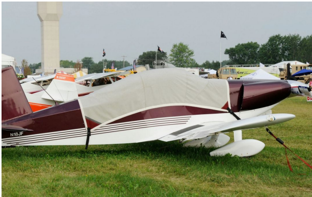
Thorp T-18 Canopy Cover

This cover type is made from Silver Acrylic Sunbrella canvas and is 100% lined with a soft and smooth microfiber. Bruce's Custom Covers developed this material combination especially for aircraft protection. The outer material is medium weight and treated for water resistance, UV resistance and anti-static buildup. The inner lining is a very soft and smooth microfiber to prevent scratching. The material is very reflective, and tests show that the cabin interior temperature can be reduced to near-ambient temperature on the hottest of days. It is water, ice and snow repellent, yet breathable to allow moisture to escape from between the cover and the aircraft surface.