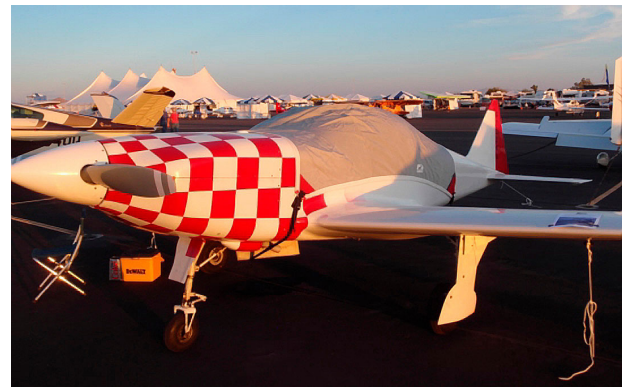
Thorp T-18 Canopy Cover