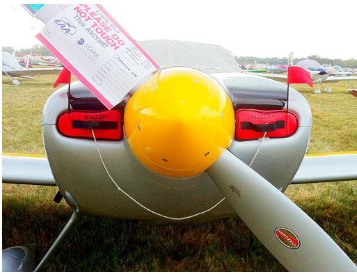
Vans's RV-7 Engine Engine Inlet Plugs