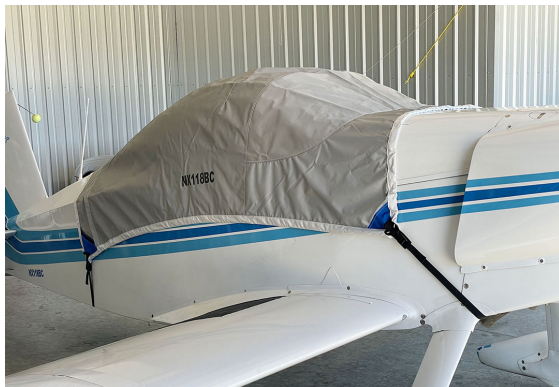
T-18 Travel Cover, Light Weight Canopy Cover (Bubble Canopy)

Travel Covers are made with Silver Solution-Dyed Polyester fabric and only lined over the windshield to save weight. The material is lightweight and more compact for easy stowage in the aircraft. The polyester material is water resistant, but only intended for occasional use outside. We also have an ultra lightweight material available for fitted hangar dust covers. For daily outdoor use, the non-travel Sunbrella Cover is the best choice.