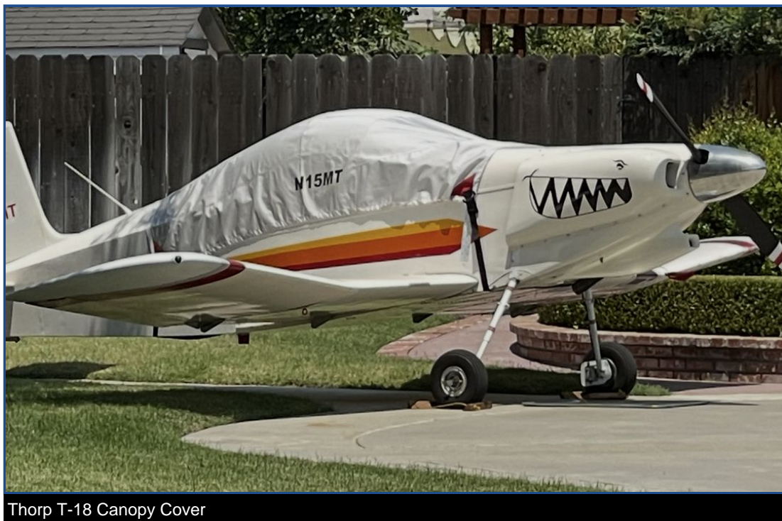
Thorp T-18 Canopy Cover