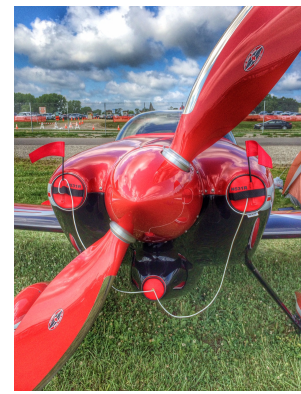
Van's RV-7 Engine Inlet Plugs