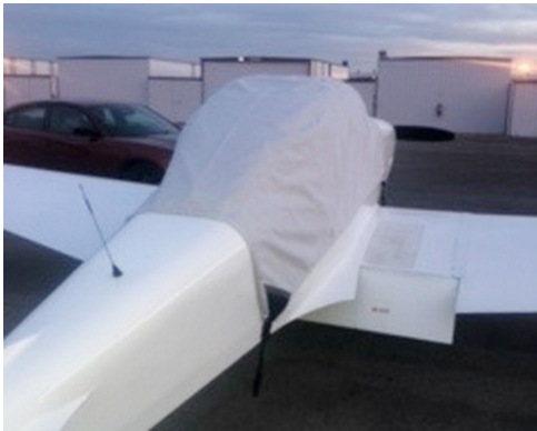
Thorp T-18 Canopy Cover