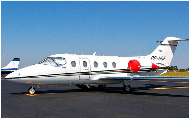
Beechjet 400 Engine Covers & Cockpit HeatShields

of medium weight nylon which is available in a variety of colors to match the paint trim. Each cover set comes complete with installation and folding instructions. The aircraft's registration number can be silkscreened onto the cover for an extra charge.