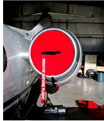
Beechjet 400A Engine Intake Plug with Generator Inlet Plug