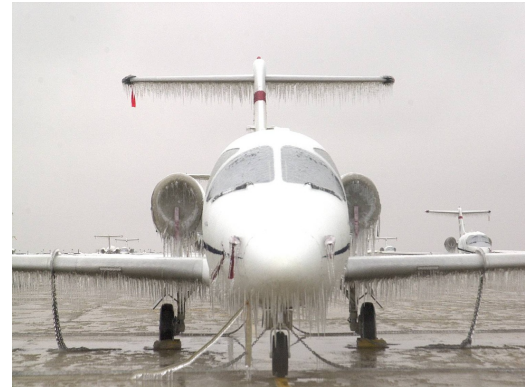
Beechjet 400 Engine Covers