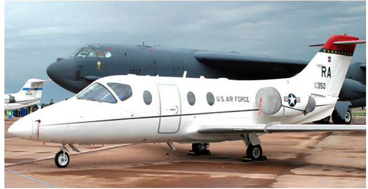
T-1A Jayhawk (Beechjet) Engine & Pitot Cover set