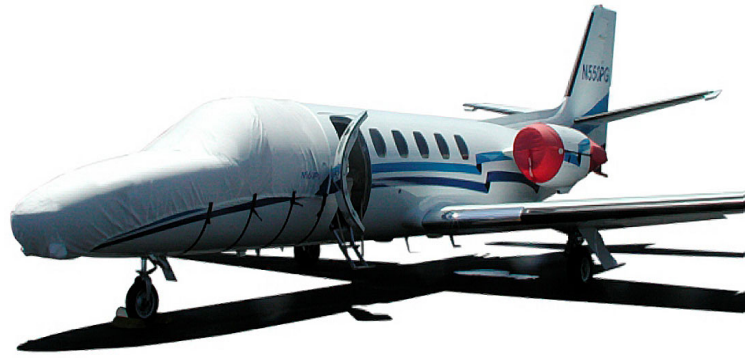
Cessna Citation Nose/Cockpit Cover, Engine Covers