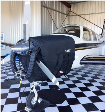
Beech Bonanza 36 Models Insulated Engine Cover

This cover type is made from Silver Acrylic Sunbrella canvas and is 100% lined with a soft and smooth microfiber. Bruce's Custom Covers developed this material combination especially for aircraft protection. The outer material is medium weight and treated for water resistance, UV resistance and anti-static buildup. The inner lining is a very soft and smooth microfiber to prevent scratching. The material is very reflective, and tests show that the cabin interior temperature can be reduced to near-ambient temperature on the hottest of days. It is water, ice and snow repellent, yet breathable to allow moisture to escape from between the cover and the aircraft surface.