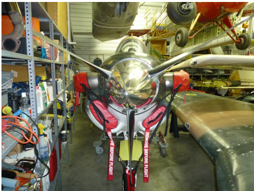
Beech T34C Engine Plugs, Prop Tie/Exhaust Plugs

of the plugs. Most plugs are imprinted with the aircraft registration number in black for an extra charge. Storage bag NOT included. Engine plugs may be inserted after flight when the engine is still warm. Engine Inlet Plugs are commonly referred to as Cowl Plugs, Intake Plugs, Cowl Blocks, Engine Blocks, and Engine Bungs.