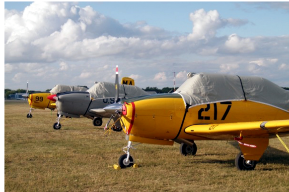
Beech T34 Canopy Cover