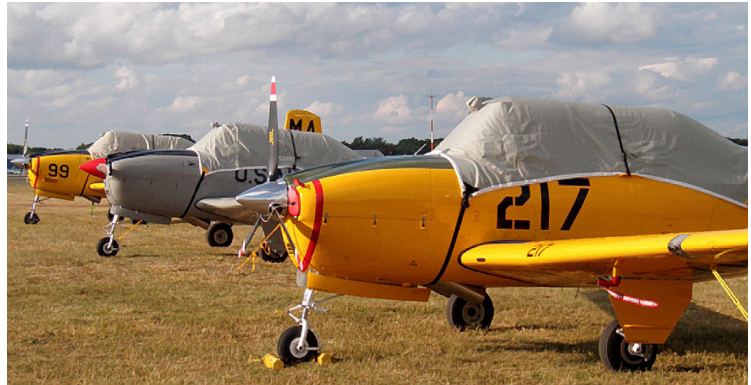
T34 Canopy Covers & Engine Inlet Plugs