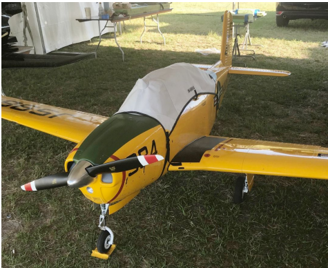
Beechcraft T-34B Mentor Canopy Cover, for 36% Scale Model