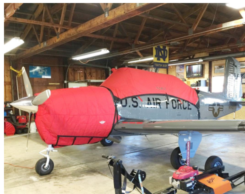
Beech T34 Mentor Canopy Cover, Insulated Engine Cover