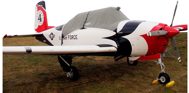
T34 Canopy Cover