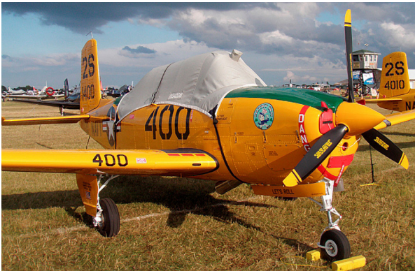
T34 Canopy Cover & Engine Inlet Plugs

This cover type is made from Silver Acrylic Sunbrella canvas and is 100% lined with a soft and smooth microfiber. Bruce's Custom Covers developed this material combination especially for aircraft protection. The outer material is medium weight and treated for water resistance, UV resistance and anti-static buildup. The inner lining is a very soft and smooth microfiber to prevent scratching. The material is very reflective, and tests show that the cabin interior temperature can be reduced to near-ambient temperature on the hottest of days. It is water, ice and snow repellent, yet breathable to allow moisture to escape from between the cover and the aircraft surface.