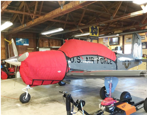
Beech T34 Mentor Canopy Cover, Insulated Engine Cover