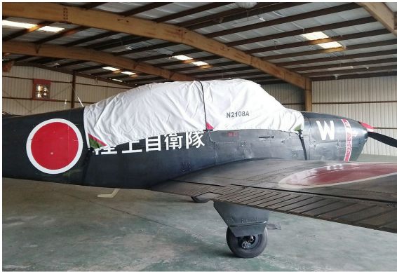
Fuji LM Canopy Cover

This cover type is made from Silver Acrylic Sunbrella canvas and is 100% lined with a soft and smooth microfiber. Bruce's Custom Covers developed this material combination especially for aircraft protection. The outer material is medium weight and treated for water resistance, UV resistance and anti-static buildup. The inner lining is a very soft and smooth microfiber to prevent scratching. The material is very reflective, and tests show that the cabin interior temperature can be reduced to near-ambient temperature on the hottest of days. It is water, ice and snow repellent, yet breathable to allow moisture to escape from between the cover and the aircraft surface.