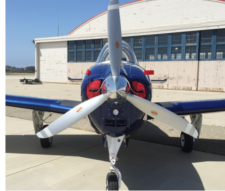
Beech T34 Engine Plugs