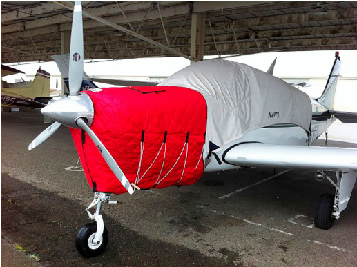
Beech Bonanza Insulated Engine Cover, fully enclosed