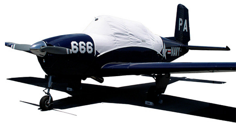
The T34 Canopy Cover

Travel Covers are made with Silver Solution-Dyed Polyester fabric and only lined over the windshield to save weight. The material is lightweight and more compact for easy stowage in the aircraft. The polyester material is water resistant, but only intended for occasional use outside. We also have an ultra lightweight material available for fitted hangar dust covers. For daily outdoor use, the non-travel Sunbrella Cover is the best choice.