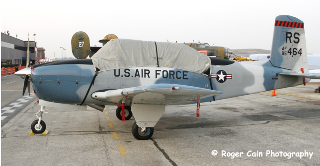
Beech T34 Canopy Cover

This cover type is made from Silver Acrylic Sunbrella canvas and is 100% lined with a soft and smooth microfiber. Bruce's Custom Covers developed this material combination especially for aircraft protection. The outer material is medium weight and treated for water resistance, UV resistance and anti-static buildup. The inner lining is a very soft and smooth microfiber to prevent scratching. The material is very reflective, and tests show that the cabin interior temperature can be reduced to near-ambient temperature on the hottest of days. It is water, ice and snow repellent, yet breathable to allow moisture to escape from between the cover and the aircraft surface.