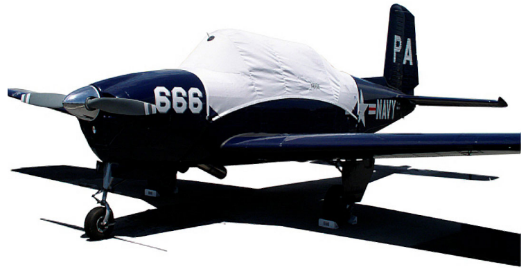
The T34 Canopy Cover