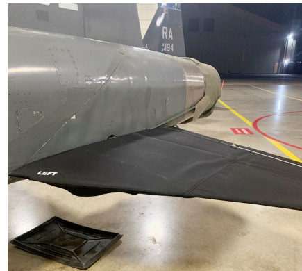
Northrup T-38 Horizontal Stabilizer Cover