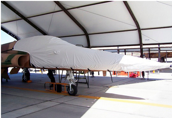
Northup F-5 Talon Canopy/Nose Cover