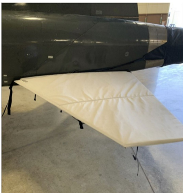
Northrup T-38 Horizontal Stabilizer Covers

WINTER USE MATERIAL - Made with Solution-Dyed Polyester fabric, this option is intended for seasonal use to aid in deicing, rain mitigation, or for occasional travel. The material is lighter and more compact, but more susceptible to UV damage and may have a shorter useful life if used continuously outside than the all-year use material.