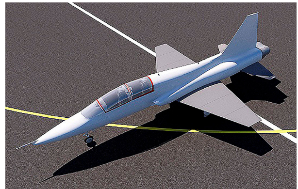
T-38 Talon Wing and Horizontal Stabilizer Covers (3D Rendering)