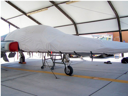
Northup F5 Talon Canopy Cover

Travel Covers are made with Silver Solution-Dyed Polyester fabric and only lined over the windshield to save weight. The material is lightweight and more compact for easy stowage in the aircraft. The polyester material is water resistant, but only intended for occasional use outside. We also have an ultra lightweight material available for fitted hangar dust covers. For daily outdoor use, the non-travel Sunbrella Cover is the best choice.