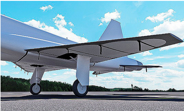
T-38 Talon Wing and Horizontal Stabilizer Covers (3D Rendering)

WINTER USE MATERIAL - Made with Solution-Dyed Polyester fabric, this option is intended for seasonal use to aid in deicing, rain mitigation, or for occasional travel. The material is lighter and more compact, but more susceptible to UV damage and may have a shorter useful life if used continuously outside than the all-year use material.