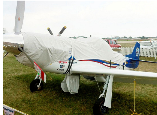
Thunder Mustang Canopy & Engine Cover