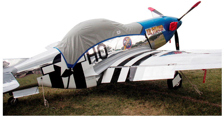
Stewart Mustang Canopy Cover, Prop Tie Downs & Intake Plugs Stewart Mustang Canopy Cover, Prop Tie Downs & Intake Plugs