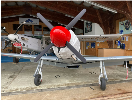
SW-51 Mustang Engine Cover

This cover type is made from Silver Acrylic Sunbrella canvas and is 100% lined with a soft and smooth microfiber. Bruce's Custom Covers developed this material combination especially for aircraft protection. The outer material is medium weight and treated for water resistance, UV resistance and anti-static buildup. The inner lining is a very soft and smooth microfiber to prevent scratching. The material is very reflective, and tests show that the cabin interior temperature can be reduced to near-ambient temperature on the hottest of days. It is water, ice and snow repellent, yet breathable to allow moisture to escape from between the cover and the aircraft surface.