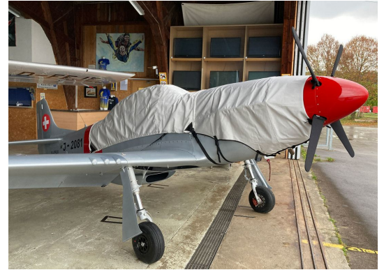
SW-51 Mustang Canopy & Engine Covers