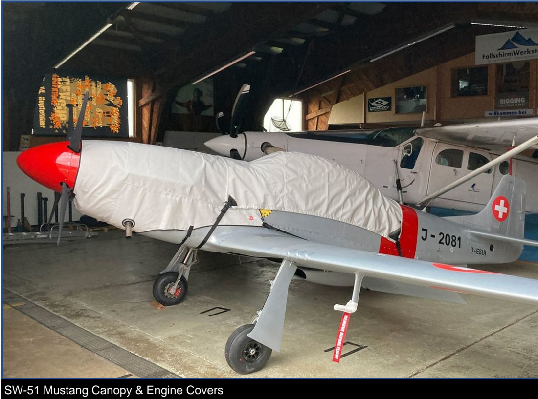
SW-51 Mustang Canopy & Engine Covers