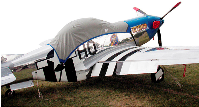
Stewart Mustang Canopy Cover, Prop Tie Downs & Intake Plugs

This cover type is made from Silver Acrylic Sunbrella canvas and is 100% lined with a soft and smooth microfiber. Bruce's Custom Covers developed this material combination especially for aircraft protection. The outer material is medium weight and treated for water resistance, UV resistance and anti-static buildup. The inner lining is a very soft and smooth microfiber to prevent scratching. The material is very reflective, and tests show that the cabin interior temperature can be reduced to near-ambient temperature on the hottest of days. It is water, ice and snow repellent, yet breathable to allow moisture to escape from between the cover and the aircraft surface.