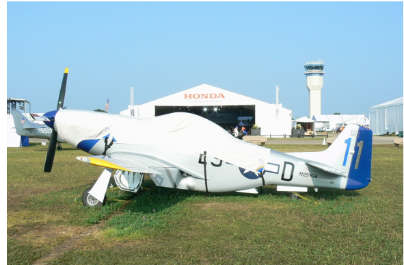
Thunder Mustang Canopy & Engine Cover