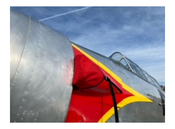
North American T6 Carb Air Scoop Cover