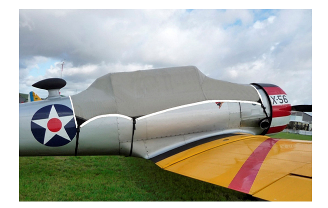
North American T6 Canopy Cover with 30" fwd ext (multi piece back glass), Engine & Prop Covers