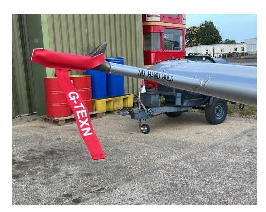
T6 Harvard Pitot Cover, shark fin type