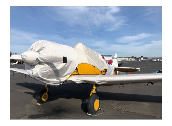
North American T6 Prop, Engine & Wing Covers