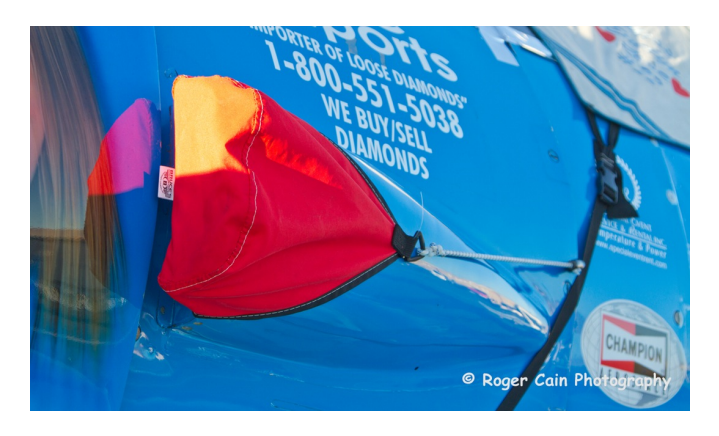
North American T6 Carb Air Scoop Cover