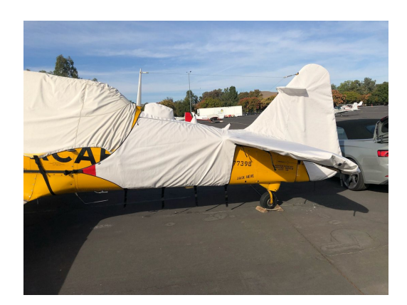
North American T6 Empennage Cover

WINTER USE MATERIAL - Made with Solution-Dyed Polyester fabric, this option is intended for seasonal use to aid in deicing, rain mitigation, or for occasional travel. The material is lighter and more compact, but more susceptible to UV damage and may have a shorter useful life if used continuously outside than the all-year use material.