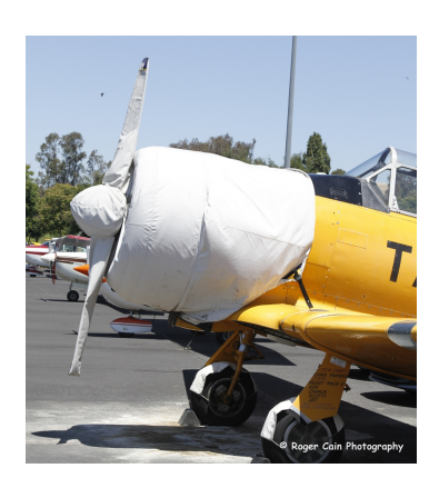
North American T6 Engine & Prop Cover