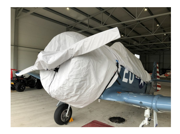
North American T6 Prop, Engine, & Canopy Covers

This cover type is made from Silver Acrylic Sunbrella canvas and is 100% lined with a soft and smooth microfiber. Bruce's Custom Covers developed this material combination especially for aircraft protection. The outer material is medium weight and treated for water resistance, UV resistance and anti-static buildup. The inner lining is a very soft and smooth microfiber to prevent scratching. The material is very reflective, and tests show that the cabin interior temperature can be reduced to near-ambient temperature on the hottest of days. It is water, ice and snow repellent, yet breathable to allow moisture to escape from between the cover and the aircraft surface.