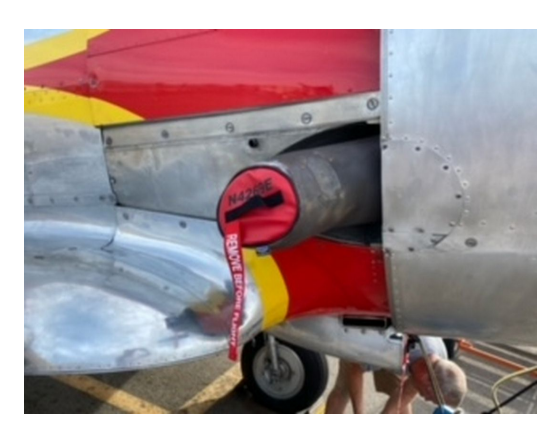
North American T6 Chin Exhaust Plug

Engine Inlet Plugs are custom fit for your North American T6, SNJ, Harvard intakes, made with heavy-duty vinyl material, and stuffed with a single block of sculpted urethane foam. Each plug has a zipper that allows the foam to be removed and dried if necessary. Engine plugs have warning flags that are visible from the cockpit or 'remove before flight' streamers sewn onto the face of the plugs. Most plugs are imprinted with the aircraft registration number in black for an extra charge. Storage bag NOT included. Engine plugs may be inserted after flight when the engine is still warm. Engine Inlet Plugs are commonly referred to as Cowl Plugs, Intake Plugs, Cowl Blocks, Engine Blocks, and Engine Bungs.