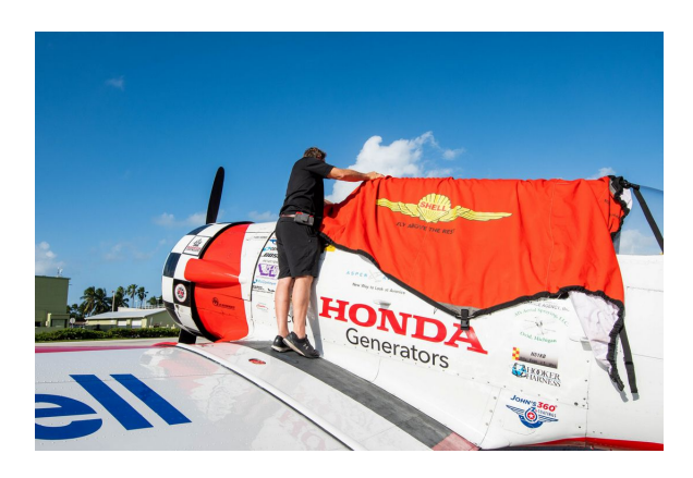
North American T6 Canopy Cover w/30" fwd Extension