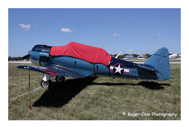
Canopy Cover with 40" forward extension

This cover type is made from Silver Acrylic Sunbrella canvas and is 100% lined with a soft and smooth microfiber. Bruce's Custom Covers developed this material combination especially for aircraft protection. The outer material is medium weight and treated for water resistance, UV resistance and anti-static buildup. The inner lining is a very soft and smooth microfiber to prevent scratching. The material is very reflective, and tests show that the cabin interior temperature can be reduced to near-ambient temperature on the hottest of days. It is water, ice and snow repellent, yet breathable to allow moisture to escape from between the cover and the aircraft surface.