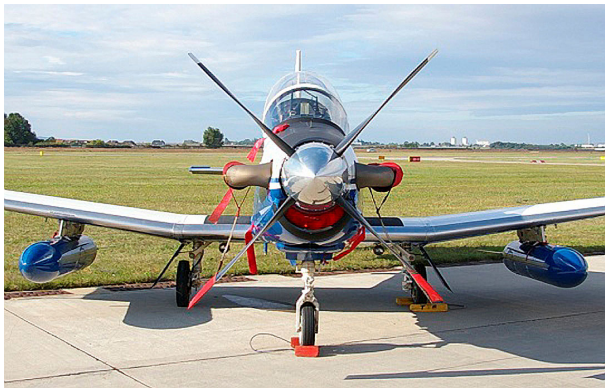
Texan II T6A Engine Inlet Plug, Prop Tie/Exhaust Covers

Engine plugs may be inserted after flight when the engine is still warm. Engine Inlet Plugs are commonly referred to as Cowl Plugs, Intake Plugs, Cowl Blocks, Engine Blocks, and Engine Bungs.