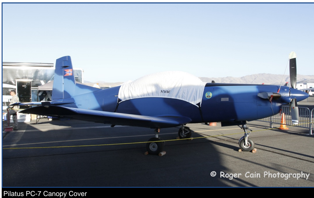
Pilatus PC-7 Canopy Cover