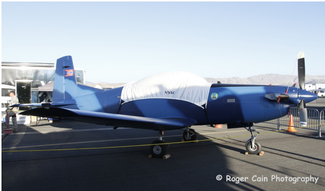
Pilatus PC-7 Canopy Cover

This cover type is made from Silver Acrylic Sunbrella canvas and is 100% lined with a soft and smooth microfiber. Bruce's Custom Covers developed this material combination especially for aircraft protection. The outer material is medium weight and treated for water resistance, UV resistance and anti-static buildup. The inner lining is a very soft and smooth microfiber to prevent scratching. The material is very reflective, and tests show that the cabin interior temperature can be reduced to near-ambient temperature on the hottest of days. It is water, ice and snow repellent, yet breathable to allow moisture to escape from between the cover and the aircraft surface.