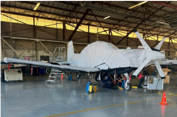
Beech T-6A Texan 2 Complete Hail Protection Cover Set

WINTER USE MATERIAL - Made with Solution-Dyed Polyester fabric, this option is intended for seasonal use to aid in deicing, rain mitigation, or for occasional travel. The material is lighter and more compact, but more susceptible to UV damage and may have a shorter useful life if used continuously outside than the all-year use material.