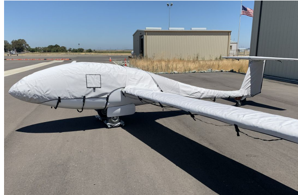
Pipistrel Taurus & Electro Canopy/Nose Cover, All Year Use