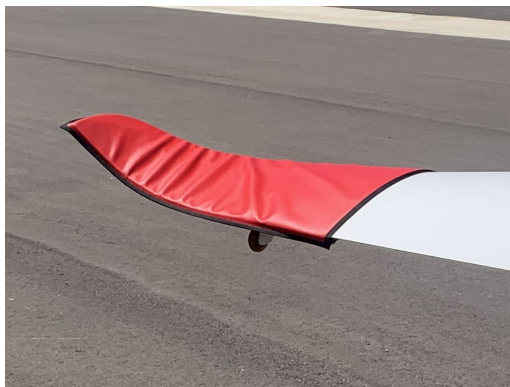
Pipistrel Taurus & Electro Wingtip Pads

Designed to prevent damage to the aircraft extremities in crowded hangars, these products are made of bright red Naugahyde and thickly padded with a sandwich of closed cell foam. Nowadays they are also made using bright red Neoprene padded laminated (think: wetsuit material).