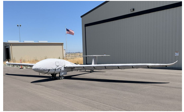
DG-505 Canopy/Nose, Wing, Empennage & Horiz. Stab. Covers Pipistrel Taurus & Electro Canopy/Nose Cover, All Year Use