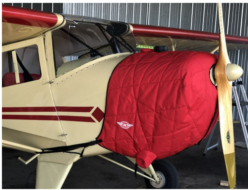
Taylorcraft Insulated Engine Cover

This cover type is made from Silver Acrylic Sunbrella canvas and is 100% lined with a soft and smooth microfiber. Bruce's Custom Covers developed this material combination especially for aircraft protection. The outer material is medium weight and treated for water resistance, UV resistance and anti-static buildup. The inner lining is a very soft and smooth microfiber to prevent scratching. The material is very reflective, and tests show that the cabin interior temperature can be reduced to near-ambient temperature on the hottest of days. It is water, ice and snow repellent, yet breathable to allow moisture to escape from between the cover and the aircraft surface.