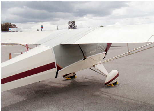
Taylorcraft Over-Top Canopy Cover

This cover type is made from Silver Acrylic Sunbrella canvas and is 100% lined with a soft and smooth microfiber. Bruce's Custom Covers developed this material combination especially for aircraft protection. The outer material is medium weight and treated for water resistance, UV resistance and anti-static buildup. The inner lining is a very soft and smooth microfiber to prevent scratching. The material is very reflective, and tests show that the cabin interior temperature can be reduced to near-ambient temperature on the hottest of days. It is water, ice and snow repellent, yet breathable to allow moisture to escape from between the cover and the aircraft surface.