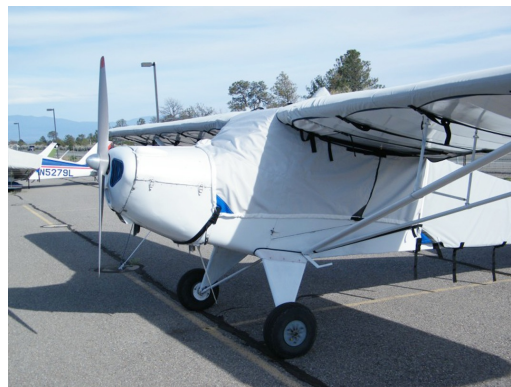
Taylorcraft Over-Top Canopy Cover & Wing Covers