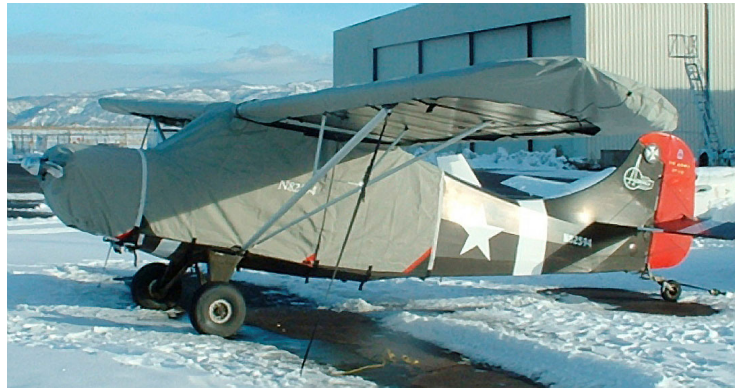
Extended Canopy Cover, Engine & Wing Covers