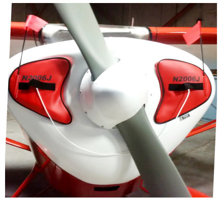
Taylorcraft Engine Inlet Plugs