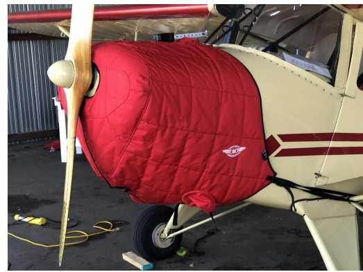
Taylorcraft Insulated Engine Cover