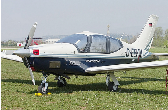
TB-9 Engine Plugs and HeatShields

Engine Inlet Plugs are custom fit for your Socata TB9-GT, Tobago: TB10-GT & TB200-GT, Trinidad: TB20-GT, TB21-GT intakes, made with heavy-duty vinyl material, and stuffed with a single block of sculpted urethane foam. Each plug has a zipper that allows the foam to be removed and dried if necessary. Engine plugs have warning flags that are visible from the cockpit or 'remove before flight' streamers sewn onto the face of the plugs. Most plugs are imprinted with the aircraft registration number in black for an extra charge. Storage bag NOT included. Engine plugs may be inserted after flight when the engine is still warm. Engine Inlet Plugs are commonly referred to as Cowl Plugs, Intake Plugs, Cowl Blocks, Engine Blocks, and Engine Bungs.