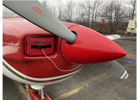
Socata Tobago Engine Plugs