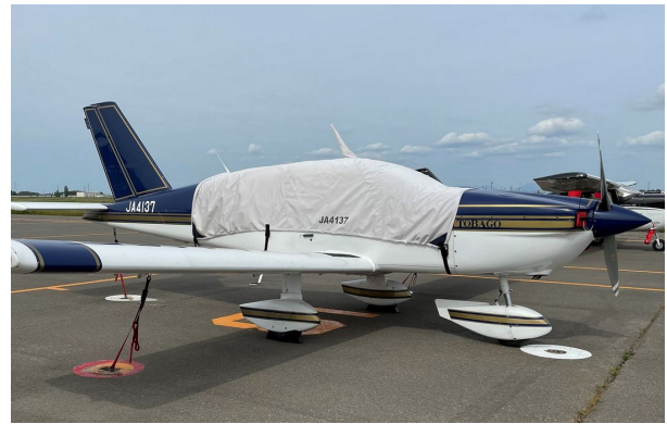
Socata TB10 Canopy Cover, Engine Plugs