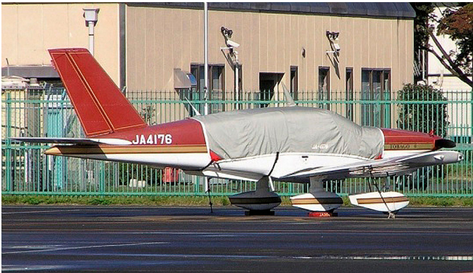
Socata TB-10 Tampico Canopy Cover