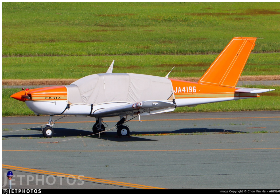
Socata TB-9 Tampico Canopy Cover

This cover type is made from Silver Acrylic Sunbrella canvas and is 100% lined with a soft and smooth microfiber. Bruce's Custom Covers developed this material combination especially for aircraft protection. The outer material is medium weight and treated for water resistance, UV resistance and anti-static buildup. The inner lining is a very soft and smooth microfiber to prevent scratching. The material is very reflective, and tests show that the cabin interior temperature can be reduced to near-ambient temperature on the hottest of days. It is water, ice and snow repellent, yet breathable to allow moisture to escape from between the cover and the aircraft surface.