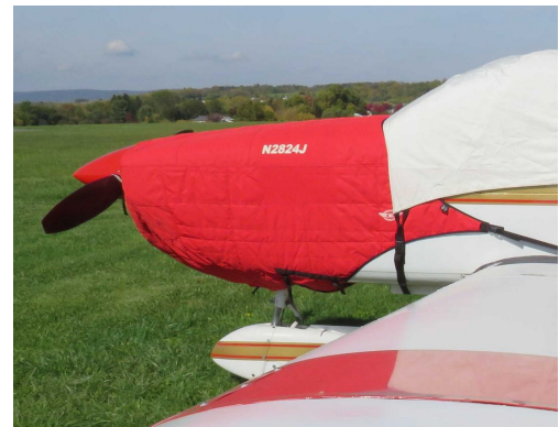
Socata TB10 Insulated Engine Cover