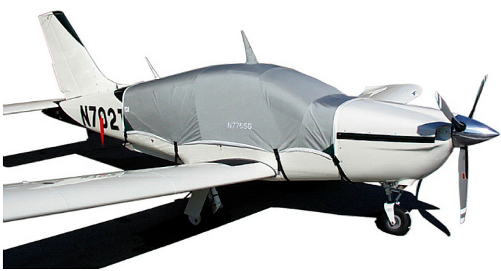
TB20 Standard Canopy Cover