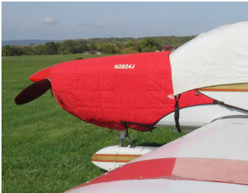
Socata TB10 Insulated Engine Cover

This cover type is made from Silver Acrylic Sunbrella canvas and is 100% lined with a soft and smooth microfiber. Bruce's Custom Covers developed this material combination especially for aircraft protection. The outer material is medium weight and treated for water resistance, UV resistance and anti-static buildup. The inner lining is a very soft and smooth microfiber to prevent scratching. The material is very reflective, and tests show that the cabin interior temperature can be reduced to near-ambient temperature on the hottest of days. It is water, ice and snow repellent, yet breathable to allow moisture to escape from between the cover and the aircraft surface.