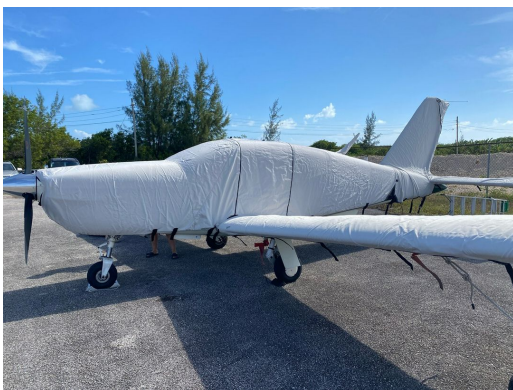
Socata TB-20 Trinidad Complete Cover Set

WINTER USE MATERIAL - Made with Solution-Dyed Polyester fabric, this option is intended for seasonal use to aid in deicing, rain mitigation, or for occasional travel. The material is lighter and more compact, but more susceptible to UV damage and may have a shorter useful life if used continuously outside than the all-year use material.