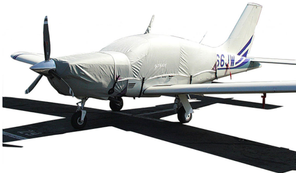
Canopy Cover & Engine Cover

This cover type is made from Silver Acrylic Sunbrella canvas and is 100% lined with a soft and smooth microfiber. Bruce's Custom Covers developed this material combination especially for aircraft protection. The outer material is medium weight and treated for water resistance, UV resistance and anti-static buildup. The inner lining is a very soft and smooth microfiber to prevent scratching. The material is very reflective, and tests show that the cabin interior temperature can be reduced to near-ambient temperature on the hottest of days. It is water, ice and snow repellent, yet breathable to allow moisture to escape from between the cover and the aircraft surface.