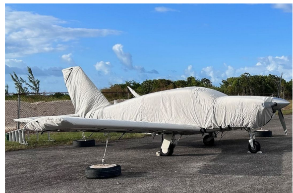
Socata TB-20 Trinidad Complete Cover Set