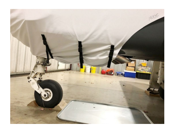
Socata Epsilon TB-30 Insulated Engine Cover, test fit cover