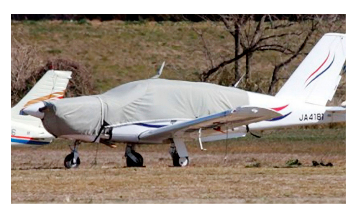
Canopy & Engine Covers