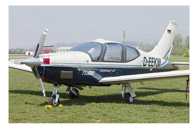
TB-9 Engine Plugs and HeatShields

Cowl Blocks, Engine Blocks, and Engine Bungs.