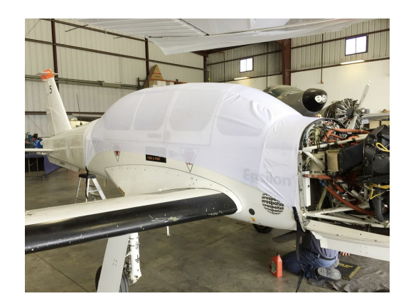
Socata TB30 Epsilon Canopy Cover, test fit cover

Travel Covers are made with Silver Solution-Dyed Polyester fabric and only lined over the windshield to save weight. The material is lightweight and more compact for easy stowage in the aircraft. The polyester material is water resistant, but only intended for occasional use outside. We also have an ultra lightweight material available for fitted hangar dust covers. For daily outdoor use, the non-travel Sunbrella Cover is the best choice.