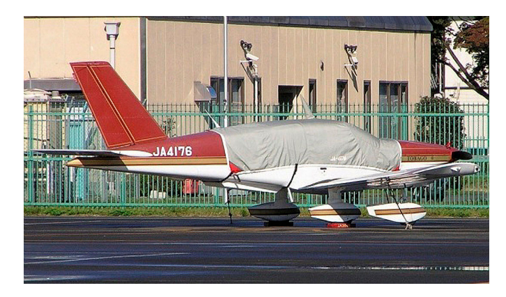
Socata TB-10 Tampico Canopy Cover

This cover type is made from Silver Acrylic Sunbrella canvas and is 100% lined with a soft and smooth microfiber. Bruce's Custom Covers developed this material combination especially for aircraft protection. The outer material is medium weight and treated for water resistance, UV resistance and anti-static buildup. The inner lining is a very soft and smooth microfiber to prevent scratching. The material is very reflective, and tests show that the cabin interior temperature can be reduced to near-ambient temperature on the hottest of days. It is water, ice and snow repellent, yet breathable to allow moisture to escape from between the cover and the aircraft surface.