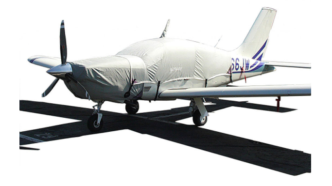
Canopy Cover & Engine Cover

This cover type is made from Silver Acrylic Sunbrella canvas and is 100% lined with a soft and smooth microfiber. Bruce's Custom Covers developed this material combination especially for aircraft protection. The outer material is medium weight and treated for water resistance, UV resistance and anti-static buildup. The inner lining is a very soft and smooth microfiber to prevent scratching. The material is very reflective, and tests show that the cabin interior temperature can be reduced to near-ambient temperature on the hottest of days. It is water, ice and snow repellent, yet breathable to allow moisture to escape from between the cover and the aircraft surface.