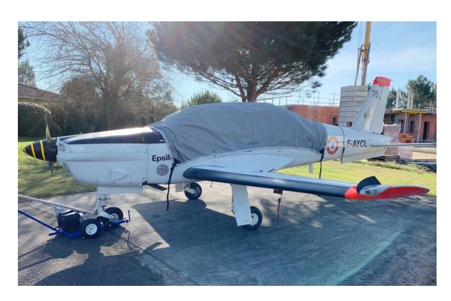
Socata TB-30 Epsilon Travel Cover, Light Weight Canopy Cover