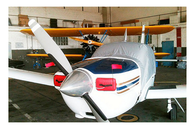
Socata TB20 Canopy Cover and Engine Inlet Plugs