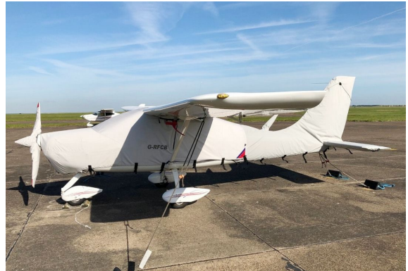
Tecnam P2008 Empennage Cover (Tailboom, Vertical & Horizontal Stabilizers), All Year Use