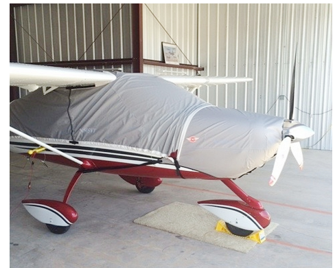
Tecnam P2008 Canopy Cover & Light Weight Engine Cover