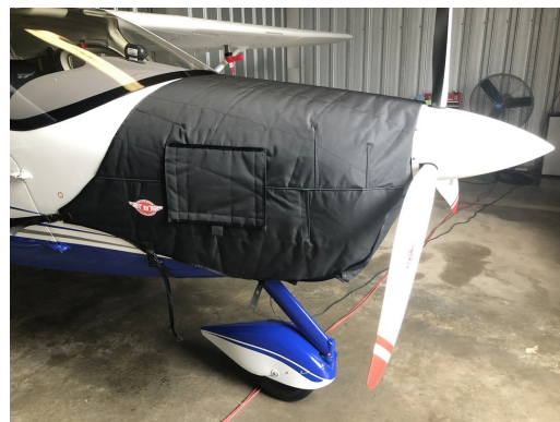
Tecnam P2008 Insulated Engine Cover