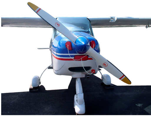
Tecnam Bravo Engine Plugs