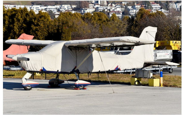
Tecnam P92 Echo Complete Cover Set