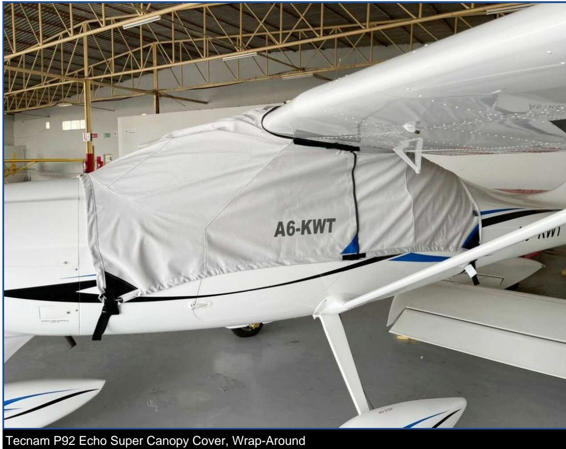
Tecnam P92 Echo Super Canopy Cover, Wrap-Around