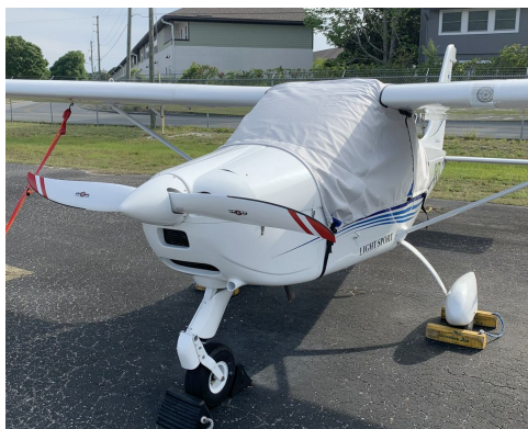
Tecnam P92 EAGLET Canopy Cover Over theTop Style

Travel Covers are made with Silver Solution-Dyed Polyester fabric and only lined over the windshield to save weight. The material is lightweight and more compact for easy stowage in the aircraft. The polyester material is water resistant, but only intended for occasional use outside. We also have an ultra lightweight material available for fitted hangar dust covers. For daily outdoor use, the non-travel Sunbrella Cover is the best choice.