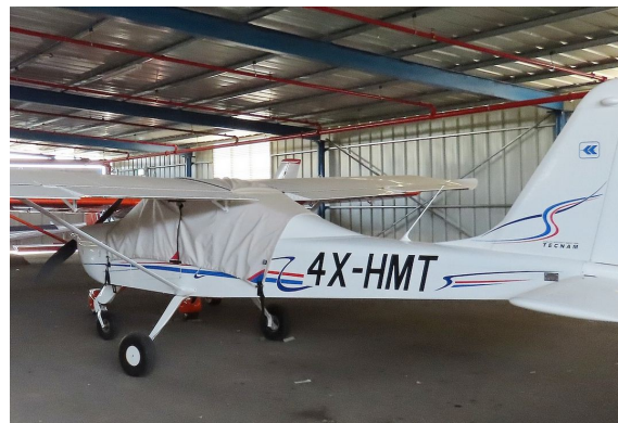
Tecnam Echo Over-Top Canopy Cover