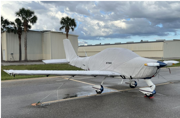
Tecnam P2002 Sierra Complete Cover Set

This cover type is made from Silver Acrylic Sunbrella canvas and is 100% lined with a soft and smooth microfiber. Bruce's Custom Covers developed this material combination especially for aircraft protection. The outer material is medium weight and treated for water resistance, UV resistance and anti-static buildup. The inner lining is a very soft and smooth microfiber to prevent scratching. The material is very reflective, and tests show that the cabin interior temperature can be reduced to near-ambient temperature on the hottest of days. It is water, ice and snow repellent, yet breathable to allow moisture to escape from between the cover and the aircraft surface.