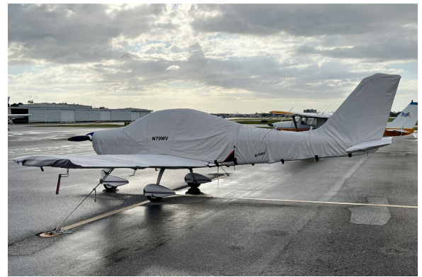
Tecnam P2002 Sierra Complete Cover Set