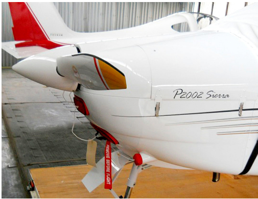
Tecnam Sierra Engine Inlet Plugs set

Engine Inlet Plugs are custom fit for your Tecnam P2002 Sierra, P96 Golf, P-Mentor intakes, made with heavy-duty vinyl material, and stuffed with a single block of sculpted urethane foam. Each plug has a zipper that allows the foam to be removed and dried if necessary. Engine plugs have warning flags that are visible from the cockpit or 'remove before flight' streamers sewn onto the face of the plugs. Most plugs are imprinted with the aircraft registration number in black for an extra charge. Storage bag NOT included. Engine plugs may be inserted after flight when the engine is still warm. Engine Inlet Plugs are commonly referred to as Cowl Plugs, Intake Plugs, Cowl Blocks, Engine Blocks, and Engine Bunges.