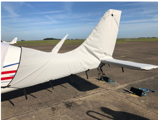
Tecnam P2008 Empennage Cover (Tailboom, Vertical & Horizontal Stabilizers), All Year Use

WINTER USE MATERIAL - Made with Solution-Dyed Polyester fabric, this option is intended for seasonal use to aid in deicing, rain mitigation, or for occasional travel. The material is lighter and more compact, but more susceptible to UV damage and may have a shorter useful life if used continuously outside than the all-year use material.