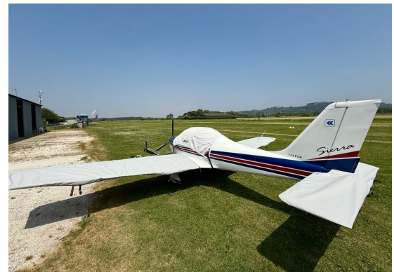
Tecnam P2002 Sierra Canopy, Wing & Horizontal Stabilizer Covers