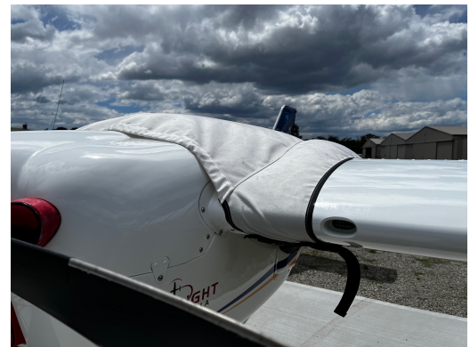
Tecnam P2006T Twin Wing & Engine Covers, All Year Use