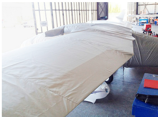
Tecnam Twin Canopy/Nose, Empennage, Wing/Engine, & Propeller/Spinner Covers

This cover type is made from Silver Acrylic Sunbrella canvas and is 100% lined with a soft and smooth microfiber. Bruce's Custom Covers developed this material combination especially for aircraft protection. The outer material is medium weight and treated for water resistance, UV resistance and anti-static buildup. The inner lining is a very soft and smooth microfiber to prevent scratching. The material is very reflective, and tests show that the cabin interior temperature can be reduced to near-ambient temperature on the hottest of days. It is water, ice and snow repellent, yet breathable to allow moisture to escape from between the cover and the aircraft surface.