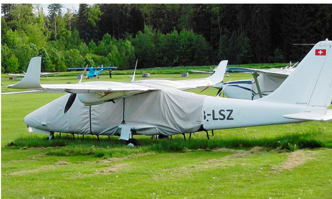
Tecnam Twin Extended Canopy/Nose Cover

This cover type is made from Silver Acrylic Sunbrella canvas and is 100% lined with a soft and smooth microfiber. Bruce's Custom Covers developed this material combination especially for aircraft protection. The outer material is medium weight and treated for water resistance, UV resistance and anti-static buildup. The inner lining is a very soft and smooth microfiber to prevent scratching. The material is very reflective, and tests show that the cabin interior temperature can be reduced to near-ambient temperature on the hottest of days. It is water, ice and snow repellent, yet breathable to allow moisture to escape from between the cover and the aircraft surface.