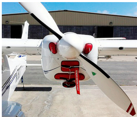
Tecnam P2006T Engine Plugs

Engine Inlet Plugs are custom fit for your Tecnam P2006T Twin intakes, made with heavy-duty vinyl material, and stuffed with a single block of sculpted urethane foam. Each plug has a zipper that allows the foam to be removed and dried if necessary. Engine plugs have warning flags that are visible from the cockpit or 'remove before flight' streamers sewn onto the face of the plugs. Most plugs are imprinted with the aircraft registration number in black for an extra charge. Storage bag NOT included. Engine plugs may be inserted after flight when the engine is still warm. Engine Inlet Plugs are commonly referred to as Cowl Plugs, Intake Plugs, Cowl Blocks, Engine Blocks, and Engine Bungs.