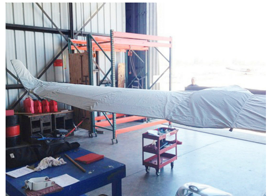
Tecnam Twin Wing/Engine Covers