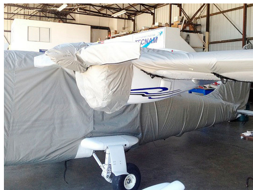
Tecnam Twin Canopy/Nose, Empennage, Wing/Engine, & Propeller/Spinner Covers