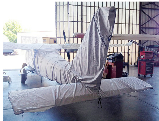
Tecnam Twin Wing & Empennage Covers Tecnam Twin Canopy/Nose, Empennage, Wing/Engine, & Propellor/Spinner Covers