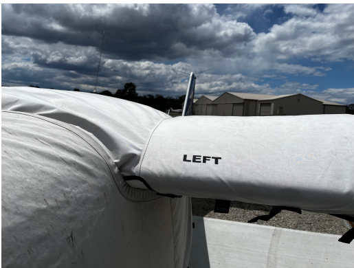
Tecnam P2006T Twin Wing & Engine Covers, All Year Use