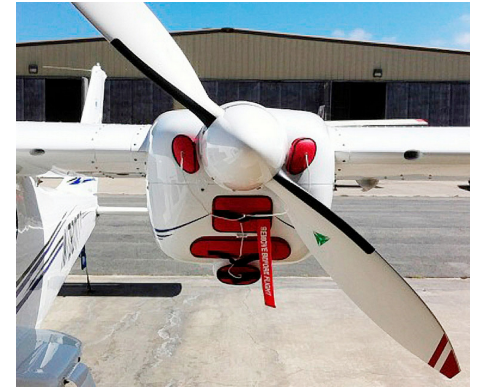
ENGINE PLUGS PREVENT BIRD NEST FOD. Piper Saratoga Engine Cowling Bird's Nest Tecnam P2006T Engine Plugs