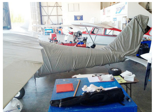
Tecnam Twin Wing & Empennage Covers