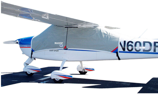
Tecnam Bravo Canopy Cover