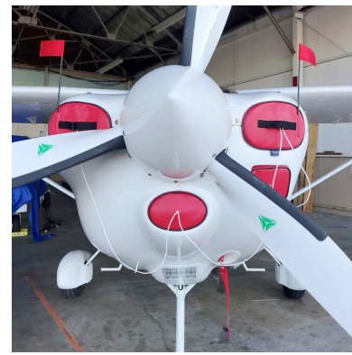
Tecnam Engine Plugs, set of 5