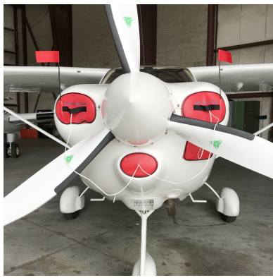
Tecnam P2010 Engine Plugs