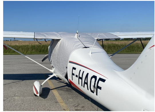
Tecnam P2010 Over-Top Canopy Cover