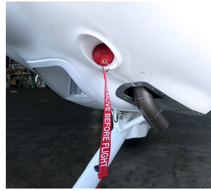
Tecnam P2010 Small Engine Inlet Plug