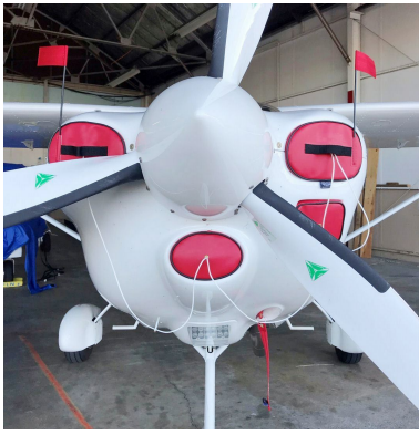
Tecnam Engine Plugs, set of 5