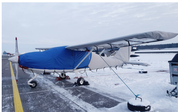
Tecnam P2010 Wing, Empennage & Prop Covers