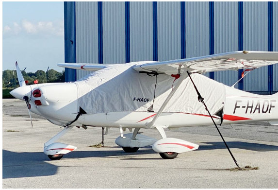
Tecnam P2010 Over-Top Canopy Cover, Engine Plugs