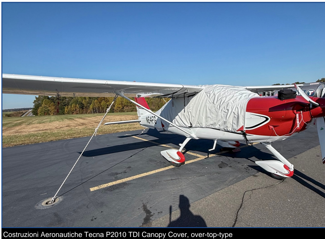
Costruzioni Aeronautiche Tecna P2010 TDI Canopy Cover, over-top-type