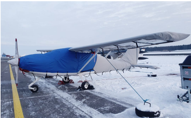
Tecnam P2010 Wing, Empennage & Prop Covers

WINTER USE MATERIAL - Made with Solution-Dyed Polyester fabric, this option is intended for seasonal use to aid in deicing, rain mitigation, or for occasional travel. The material is lighter and more compact, but more susceptible to UV damage and may have a shorter useful life if used continuously outside than the all-year use material.