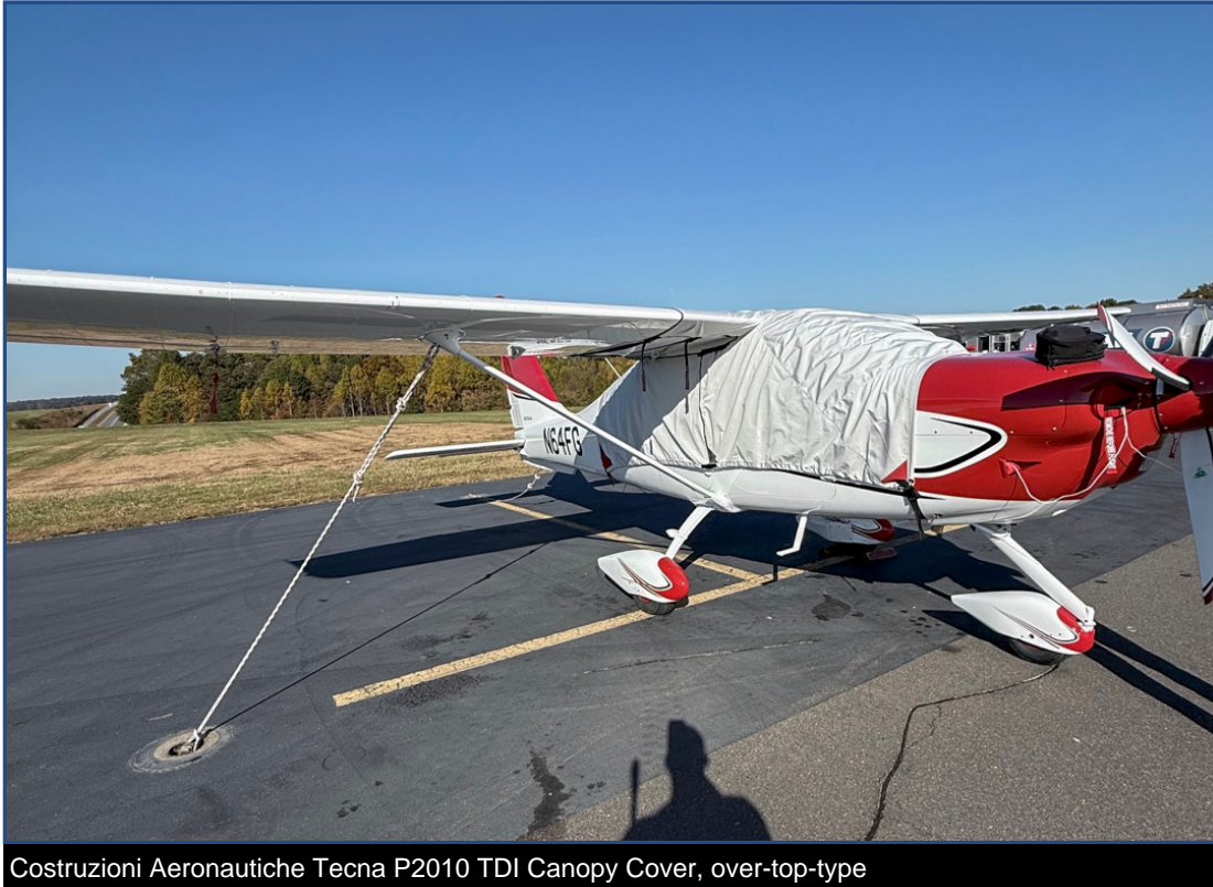
Costruzioni Aeronautiche Tecna P2010 TDI Canopy Cover, over-top-type