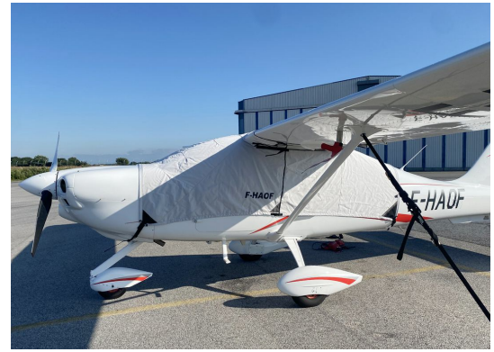
Tecnam P2010 Over-Top Canopy Cover