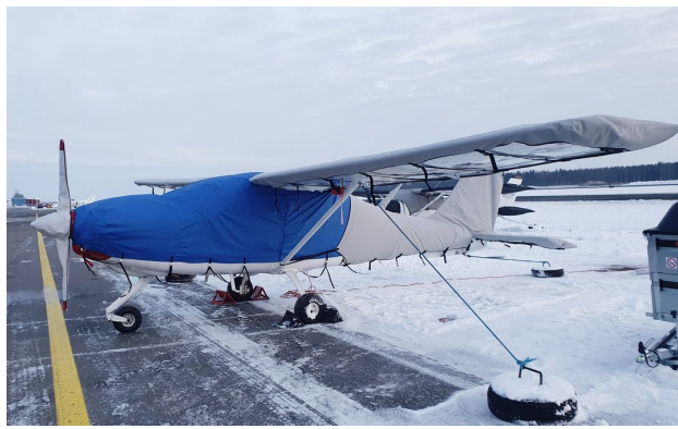
Tecnam P2010 Wing, Empennage & Prop Covers