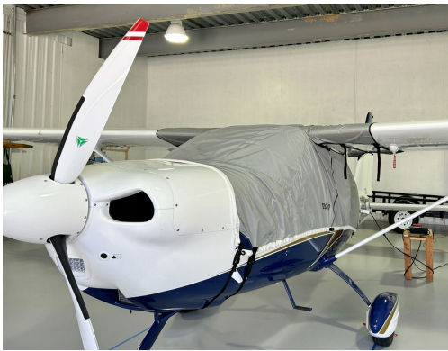
Tecnam P2010 Lightweight Travel Canopy Cover

occasional use outside. We also have an ultra lightweight material available for fitted hangar dust covers. For daily outdoor use, the non-travel Sunbrella Cover is the best choice.