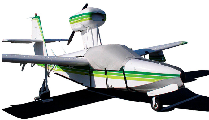
Lake LA-250 Canopy Cover