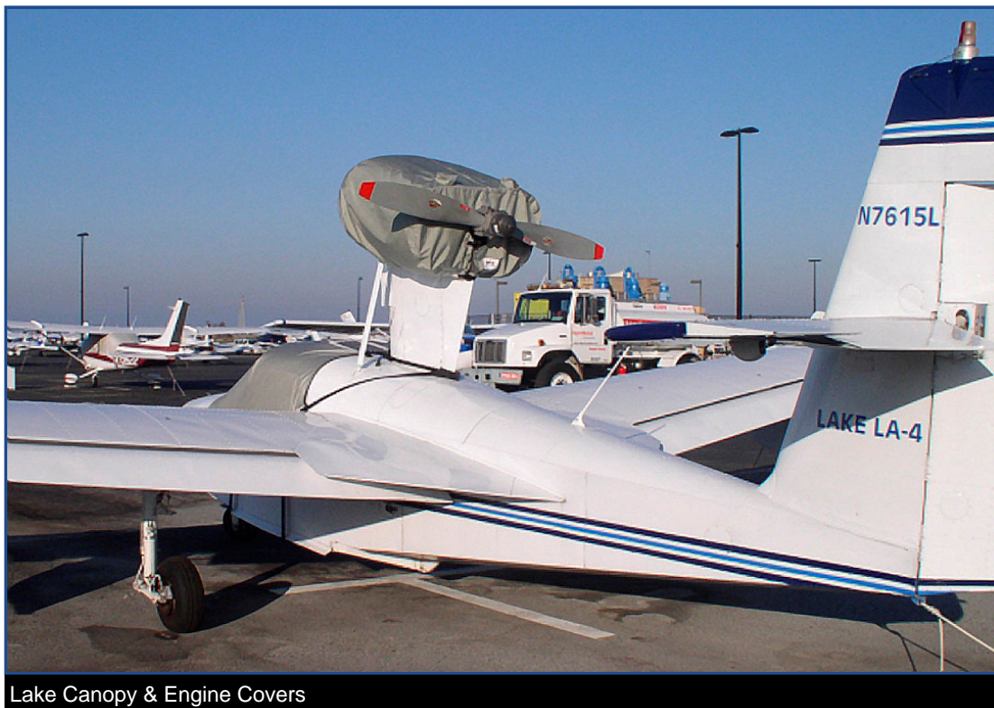
Lake Canopy &amp; Engine Covers