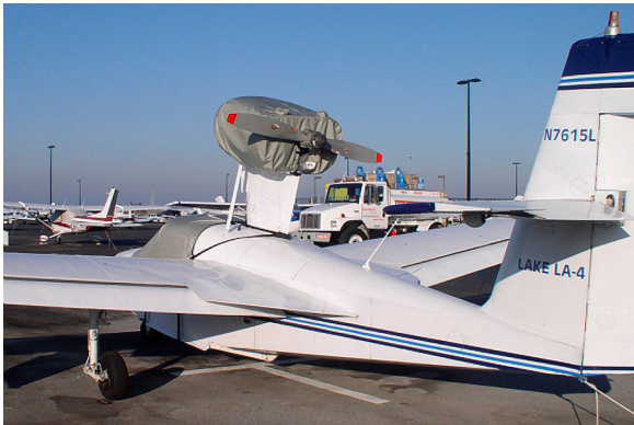
Lake Canopy & Engine Covers