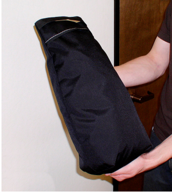
Light Weight Travel-Cover Mini-Storage Bag: 18" x 6" x 4"

The material is very reflective, and tests show that the cabin interior temperature can be reduced to near-ambient temperature on the hottest of days. It is water, ice and snow repellent, yet breathable to allow moisture to escape from between the cover and the aircraft surface.