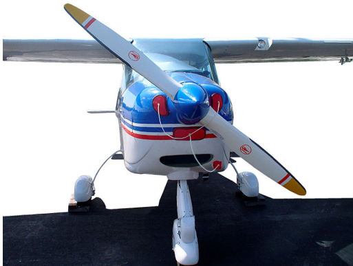
Tecnam Bravo Engine Plugs