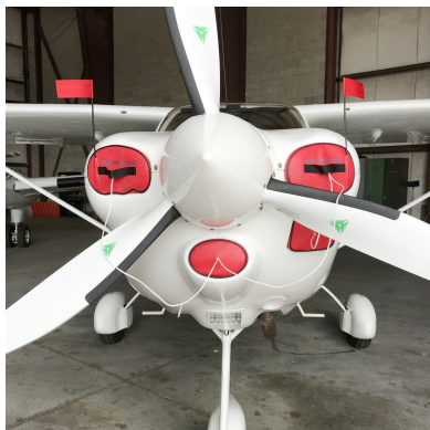
Tecnam P2010 Engine Plugs

Engine Inlet Plugs are custom fit for your Tecnam P92 Eaglet intakes, made with heavy-duty vinyl material, and stuffed with a single block of sculpted urethane foam. Each plug has a zipper that allows the foam to be removed and dried if necessary. Engine plugs have warning flags that are visible from the cockpit or 'remove before flight' streamers sewn onto the face of the plugs. Most plugs are imprinted with the aircraft registration number in black for an extra charge. Storage bag NOT included. Engine plugs may be inserted after flight when the engine is still warm. Engine Inlet Plugs are commonly referred to as Cowl Plugs, Intake Plugs, Cowl Blocks, Engine Blocks, and Engine Bungs.