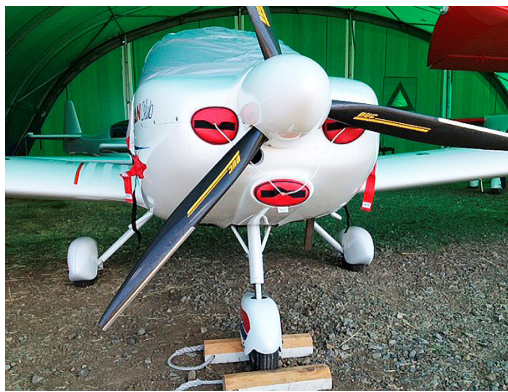
Texan Club Sport 550 Lightweight Travel Cover and Engine Inlet Plugs set