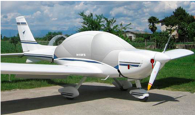
Texan Canopy Cover & Engine Plugs (Illustration)

This cover type is made from Silver Acrylic Sunbrella canvas and is 100% lined with a soft and smooth microfiber. Bruce's Custom Covers developed this material combination especially for aircraft protection. The outer material is medium weight and treated for water resistance, UV resistance and anti-static buildup. The inner lining is a very soft and smooth microfiber to prevent scratching. The material is very reflective, and tests show that the cabin interior temperature can be reduced to near-ambient temperature on the hottest of days. It is water, ice and snow repellent, yet breathable to allow moisture to escape from between the cover and the aircraft surface.