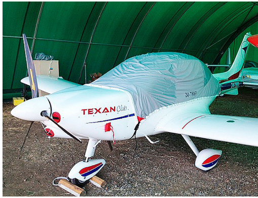
Texan Club Sport 550 Lightweight Travel Cover and Engine Inlet Plugs set