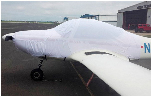
Taifun 17E Canopy/Engine Cover, test fit cover