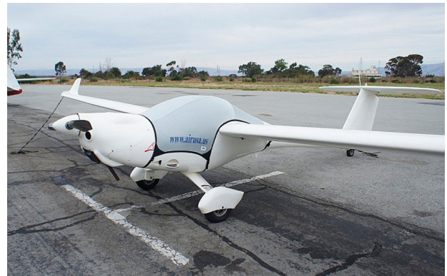
Lambda Canopy Cover