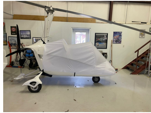
MTO Sport Gyrocopter Canopy/Nose Cover, test fit cover