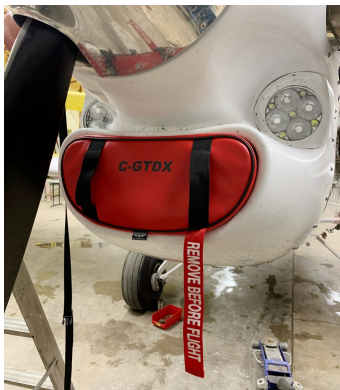
Ayres Thrush Intake Plug (Cascade Conversion)

Engine Inlet Plugs are custom fit for your Ayres Thrush intakes, made with heavy-duty vinyl material, and stuffed with a single block of sculpted urethane foam. Each plug has a zipper that allows the foam to be removed and dried if necessary. Engine plugs have warning flags that are visible from the cockpit or 'remove before flight' streamers sewn onto the face of the plugs. Most plugs are imprinted with the aircraft registration number in black for an extra charge. Storage bag NOT included. Engine plugs may be inserted after flight when the engine is still warm. Engine Inlet Plugs are commonly referred to as Cowl Plugs, Intake Plugs, Cowl Blocks, Engine Blocks, and Engine Bungs.