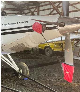
Ayres Thrush Prop Tie/Exhaust Covers