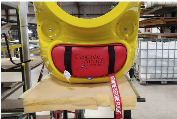
Thrush Intake Plug (Cascade Conversion)