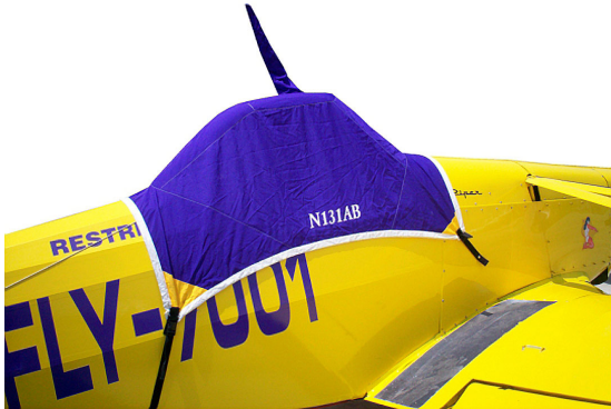
Piper Pawnee Canopy Cover