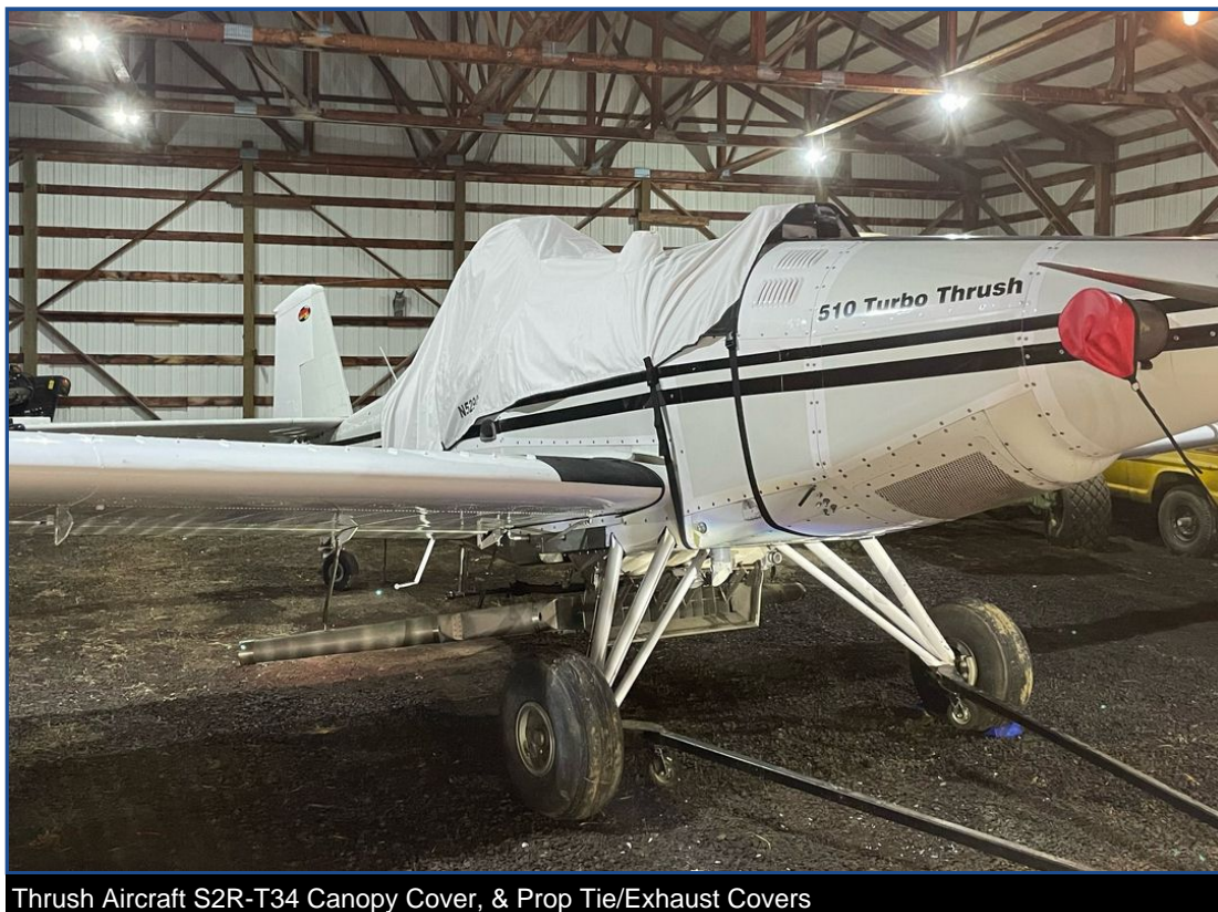
Thrush Aircraft S2R-T34 Canopy Cover, &amp; Prop Tie/Exhaust Covers