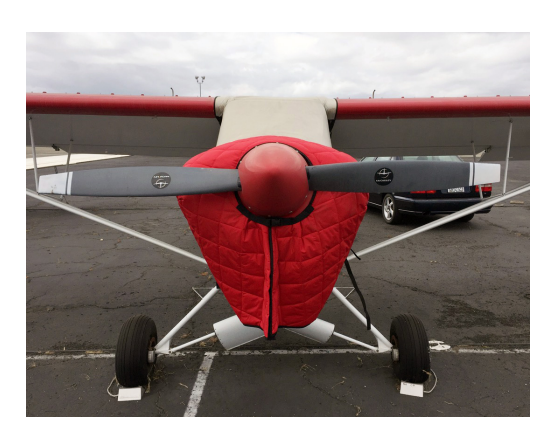
FOR INTERIOR USE. Cub Crafters CC-11 Insulated Hangar Blanket, available in Red or Silver