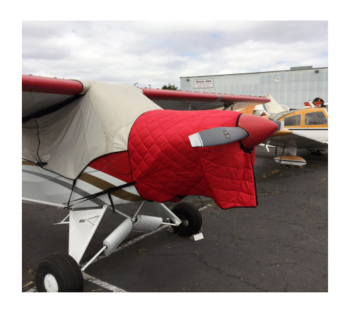
FOR INTERIOR USE. Cub Crafters CC-11 Insulated Hangar Blanket, available in Red or Silver

This cover type is made from Silver Acrylic Sunbrella canvas and is 100% lined with a soft and smooth microfiber. Bruce's Custom Covers developed this material combination especially for aircraft protection. The outer material is medium weight and treated for water resistance, UV resistance and anti-static buildup. The inner lining is a very soft and smooth microfiber to prevent scratching. The material is very reflective, and tests show that the cabin interior temperature can be reduced to near-ambient temperature on the hottest of days. It is water, ice and snow repellent, yet breathable to allow moisture to escape from between the cover and the aircraft surface.