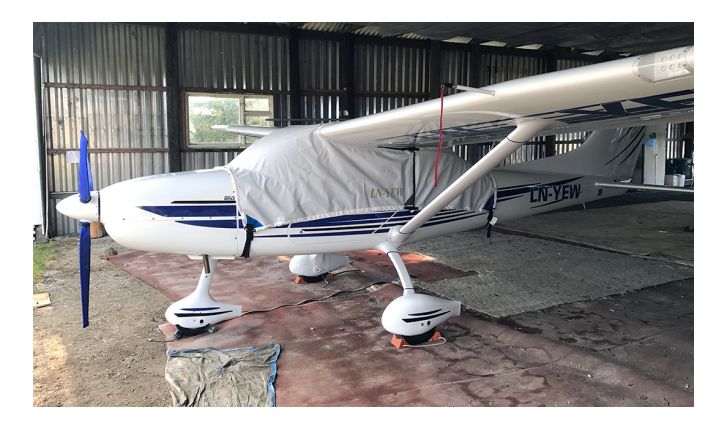
TL Ultralight Sirius TL-3000 Canopy Cover (Over-The-Top Style)