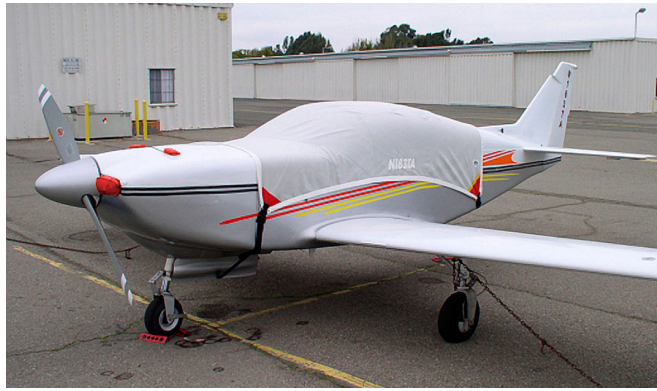
Glasair II/III Canopy Cover & Plugs