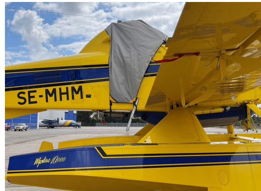
Air Tractor Light Weight Canopy Cover