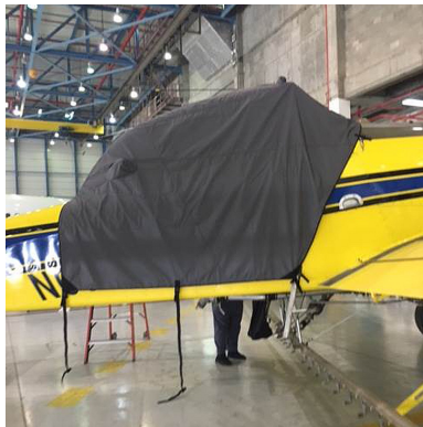
Air Tractor AT-802F Canopy Cover

Travel Covers are made with Silver Solution-Dyed Polyester fabric and only lined over the windshield to save weight. The material is lightweight and more compact for easy stowage in the aircraft. The polyester material is water resistant, but only intended for occasional use outside. We also have an ultra lightweight material available for fitted hangar dust covers. For daily outdoor use, the non-travel Sunbrella Cover is the best choice.