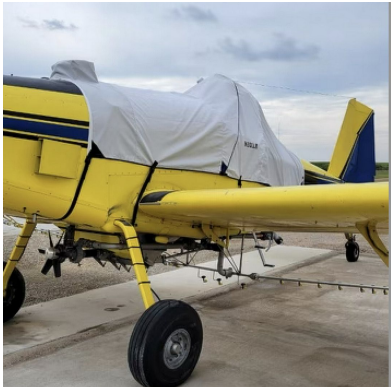
Air Tractor Inc AT-802A Canopy/Hopper Cover

This cover type is made from Silver Acrylic Sunbrella canvas and is 100% lined with a soft and smooth microfiber. Bruce's Custom Covers developed this material combination especially for aircraft protection. The outer material is medium weight and treated for water resistance, UV resistance and anti-static buildup. The inner lining is a very soft and smooth microfiber to prevent scratching. The material is very reflective, and tests show that the cabin interior temperature can be reduced to near-ambient temperature on the hottest of days. It is water, ice and snow repellent, yet breathable to allow moisture to escape from between the cover and the aircraft surface.