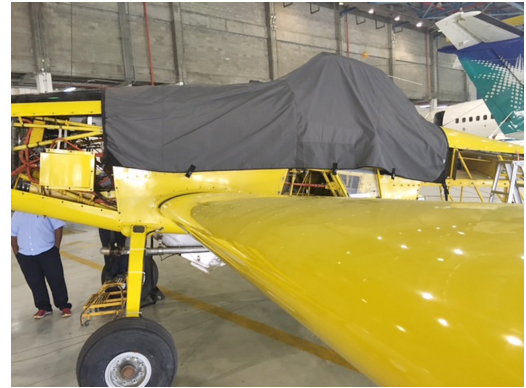
Air Tractor AT-802A Canopy/Hopper Cover