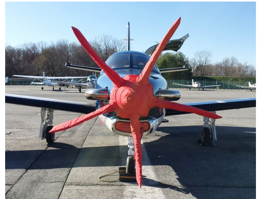
Socata TBM Insulated 5-Blade Prop/Spinner Cover