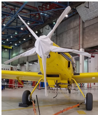
Air Tractor 5-Blade Prop Cover

This cover type is made from Silver Acrylic Sunbrella canvas and is 100% lined with a soft and smooth microfiber. Bruce's Custom Covers developed this material combination especially for aircraft protection. The outer material is medium weight and treated for water resistance, UV resistance and anti-static buildup. The inner lining is a very soft and smooth microfiber to prevent scratching. The material is very reflective, and tests show that the cabin interior temperature can be reduced to near-ambient temperature on the hottest of days. It is water, ice and snow repellent, yet breathable to allow moisture to escape from between the cover and the aircraft surface.