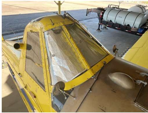
Air Tractor Cockpit HeatShields

Windshield Heatshields are interior sunshades for an aircraft's front windshield. The product is a unique composite of closed-cell foam with a silver mylar finish. The semi-rigid design is stiff enough to stand along the inside of the windshield using sun visors or window framing. It folds up flat and easily stores in the included storage sleeve. Some designs may require velcro and suction cups or split right and left sides. A Heatshield is an excellent short-term remedy for cockpit overheating. An external fabric cover is far more effective and practical for long-term protection.