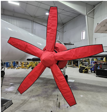
Fairchild Metro 5 Blade Insulated Insulated Prop Covers

This cover type is made from Silver Acrylic Sunbrella canvas and is 100% lined with a soft and smooth microfiber. Bruce's Custom Covers developed this material combination especially for aircraft protection. The outer material is medium weight and treated for water resistance, UV resistance and anti-static buildup. The inner lining is a very soft and smooth microfiber to prevent scratching. The material is very reflective, and tests show that the cabin interior temperature can be reduced to near-ambient temperature on the hottest of days. It is water, ice and snow repellent, yet breathable to allow moisture to escape from between the cover and the aircraft surface.