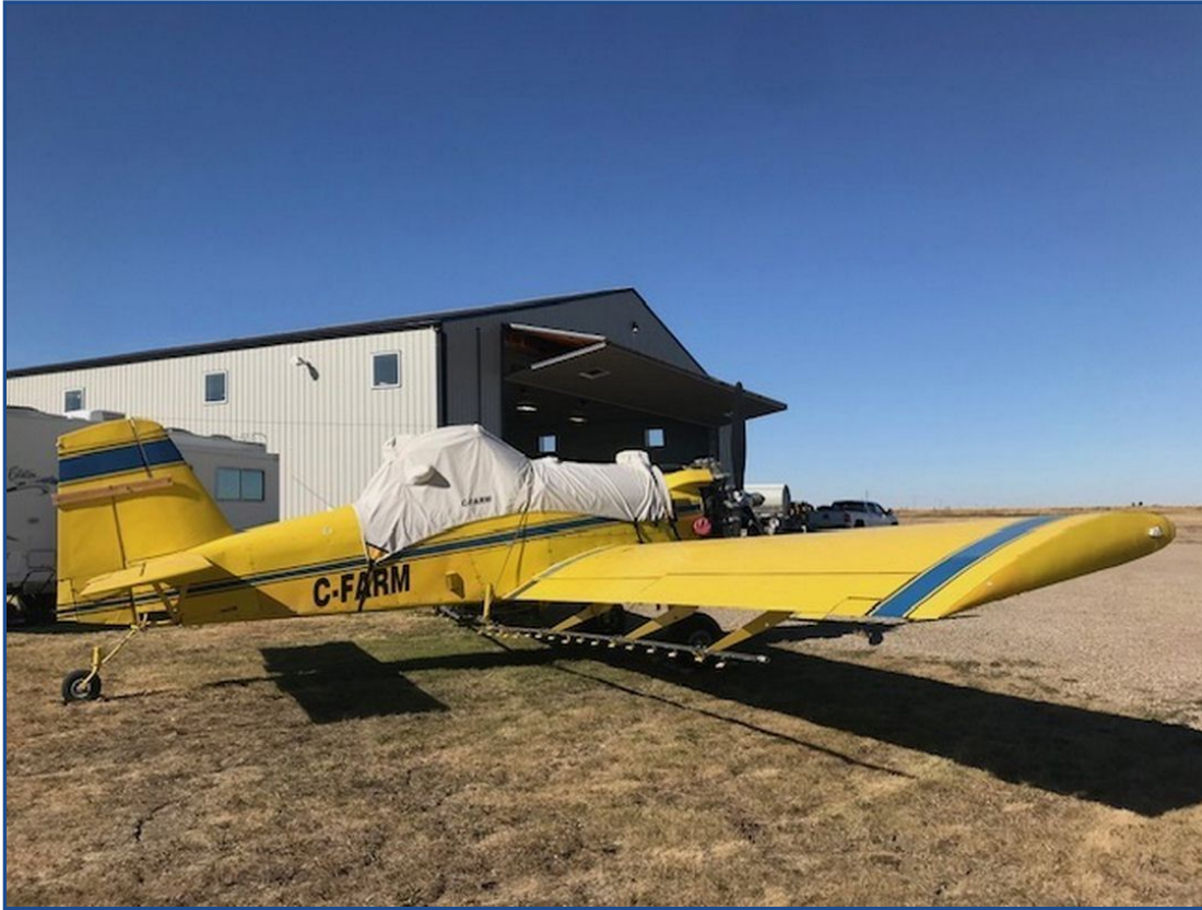
Air Tractor 401 Canopy/Hopper Cover