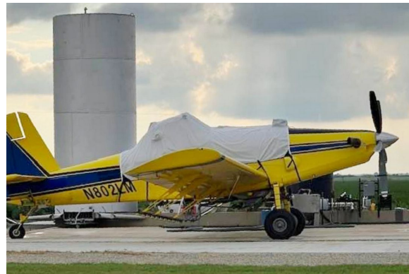
Air Tractor Inc AT-802A Canopy/Hopper Cover