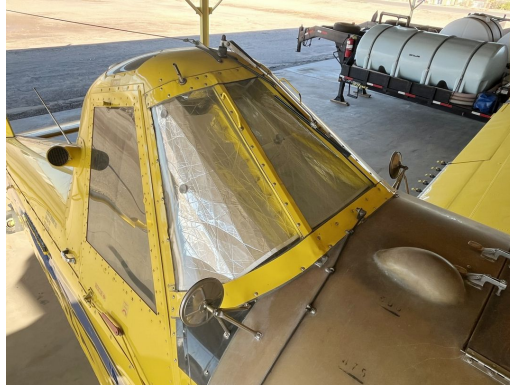
Air Tractor Cockpit HeatShields

foam with a silver mylar finish. The semi-rigid design is stiff enough to stand along the inside of the windshield using sun visors or window framing. It folds up flat and easily stores in the included storage sleeve. Some designs may require velcro and suction cups or split right and left sides. A Heatshield is an excellent short-term remedy for cockpit overheating. An external fabric cover is far more effective and practical for long-term protection.