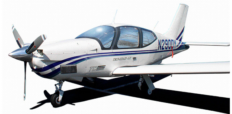
Socata TB20 HeatShields