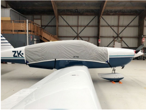
Socata TB-9 TRAVEL COVER, Light Weight Canopy Cover

Travel Covers are made with Silver Solution-Dyed Polyester fabric and only lined over the windshield to save weight. The material is lightweight and more compact for easy stowage in the aircraft. The polyester material is water resistant, but only intended for occasional use outside. We also have an ultra lightweight material available for fitted hangar dust covers. For daily outdoor use, the non-travel Sunbrella Cover is the best choice.