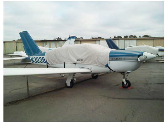
Socata TB-20 Trinidad Canopy Cover