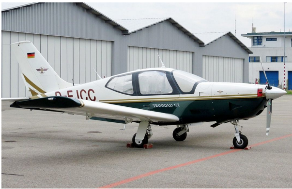
Socata Tobago TB20 Heatshields

Windshield Heatshields are interior sunshades for an aircraft's front windshield. The product is a unique composite of closed-cell foam with a silver mylar finish. The semi-rigid design is stiff enough to stand along the inside of the windshield using sun visors or window framing. It folds up flat and easily stores in the included storage sleeve. Some designs may require velcro and suction cups or split right and left sides. A Heatshield is an excellent short-term remedy for cockpit overheating. An external fabric cover is far more effective and practical for long-term protection.