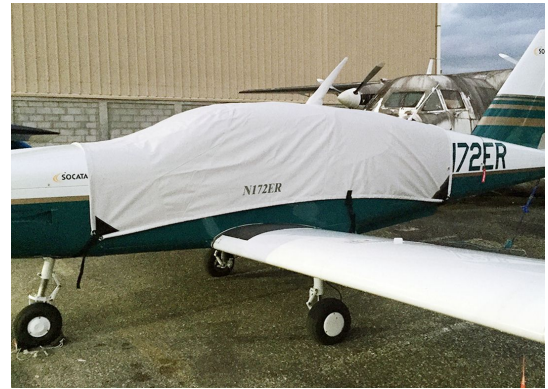
Socata TB 9 Tampico Canopy Cover