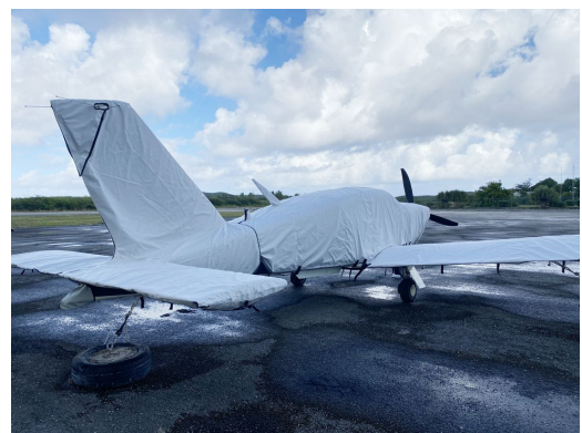
Socata Trinidad Full Cover Set