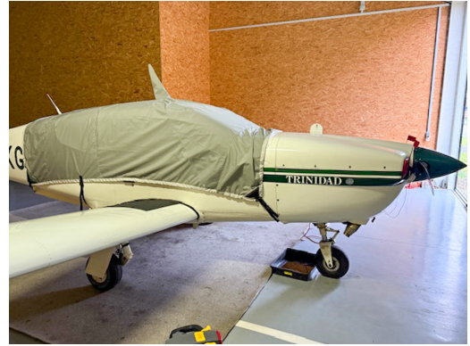
Trinidad TB20 Travel Cover, Light Weight Canopy Cover