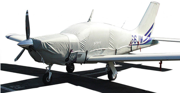
Trinidad/Tobago Canopy Cover & Engine Covers

This cover type is made from Silver Acrylic Sunbrella canvas and is 100% lined with a soft and smooth microfiber. Bruce's Custom Covers developed this material combination especially for aircraft protection. The outer material is medium weight and treated for water resistance, UV resistance and anti-static buildup. The inner lining is a very soft and smooth microfiber to prevent scratching. The material is very reflective, and tests show that the cabin interior temperature can be reduced to near-ambient temperature on the hottest of days. It is water, ice and snow repellent, yet breathable to allow moisture to escape from between the cover and the aircraft surface.