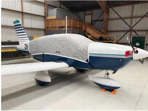
Socata TB-9 TRAVEL COVER, Light Weight Canopy Cover

Travel Covers are made with Silver Solution-Dyed Polyester fabric and only lined over the windshield to save weight. The material is lightweight and more compact for easy stowage in the aircraft. The polyester material is water resistant, but only intended for occasional use outside. We also have an ultra lightweight material available for fitted hangar dust covers. For daily outdoor use, the non-travel Sunbrella Cover is the best choice.