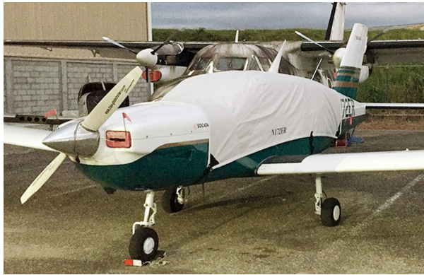
Socata TB-9 Tampico Canopy Cover and Engine Inlet Plugs

This cover type is made from Silver Acrylic Sunbrella canvas and is 100% lined with a soft and smooth microfiber. Bruce's Custom Covers developed this material combination especially for aircraft protection. The outer material is medium weight and treated for water resistance, UV resistance and anti-static buildup. The inner lining is a very soft and smooth microfiber to prevent scratching. The material is very reflective, and tests show that the cabin interior temperature can be reduced to near-ambient temperature on the hottest of days. It is water, ice and snow repellent, yet breathable to allow moisture to escape from between the cover and the aircraft surface.