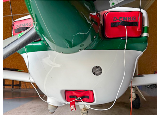
Trinidad TB20 Engine Inlet Plugs (set of 3)