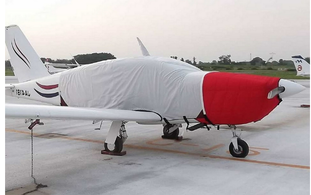
Socata TB-20/21 Extended Canopy Cover and Insulated Engine Cover