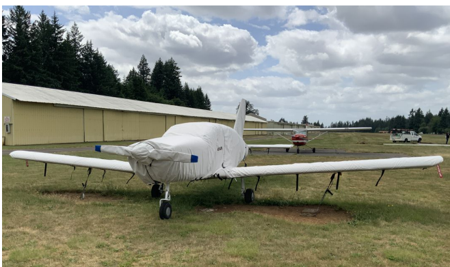
Socata Tampico TB-9C Cover Set

WINTER USE MATERIAL - Made with Solution-Dyed Polyester fabric, this option is intended for seasonal use to aid in deicing, rain mitigation, or for occasional travel. The material is lighter and more compact, but more susceptible to UV damage and may have a shorter useful life if used continuously outside than the all-year use material.