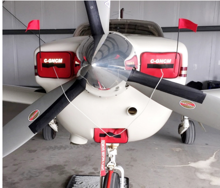
Socata TB-20 Engine Plugs, set of 3

Engine Inlet Plugs are custom fit for your Socata Tampico, Tobago & Trinidad intakes, made with heavy-duty vinyl material, and stuffed with a single block of sculpted urethane foam. Each plug has a zipper that allows the foam to be removed and dried if necessary. Engine plugs have warning flags that are visible from the cockpit or 'remove before flight' streamers sewn onto the face of the plugs. Most plugs are imprinted with the aircraft registration number in black for an extra charge. Storage bag NOT included. Engine plugs may be inserted after flight when the engine is still warm. Engine Inlet Plugs are commonly referred to as Cowl Plugs, Intake Plugs, Cowl Blocks, Engine Blocks, and Engine Bungs.