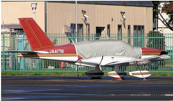
Socata TB-10 Tampico Canopy Cover

This cover type is made from Silver Acrylic Sunbrella canvas and is 100% lined with a soft and smooth microfiber. Bruce's Custom Covers developed this material combination especially for aircraft protection. The outer material is medium weight and treated for water resistance, UV resistance and anti-static buildup. The inner lining is a very soft and smooth microfiber to prevent scratching. The material is very reflective, and tests show that the cabin interior temperature can be reduced to near-ambient temperature on the hottest of days. It is water, ice and snow repellent, yet breathable to allow moisture to escape from between the cover and the aircraft surface.