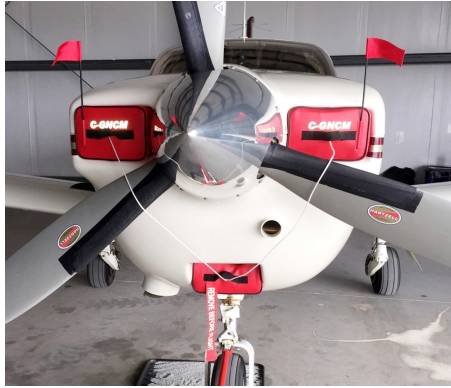
Socata TB-20 Engine Plugs, set of 3

Engine Inlet Plugs are custom fit for your Socata Tampico, Tobago & Trinidad intakes, made with heavy-duty vinyl material, and stuffed with a single block of sculpted urethane foam. Each plug has a zipper that allows the foam to be removed and dried if necessary. Engine plugs have warning flags that are visible from the cockpit or 'remove before flight' streamers sewn onto the face of the plugs. Most plugs are imprinted with the aircraft registration number in black for an extra charge. Storage bag NOT included. Engine plugs may be inserted after flight when the engine is still warm. Engine Inlet Plugs are commonly referred to as Cowl Plugs, Intake Plugs, Cowl Blocks, Engine Blocks, and Engine Bungs.