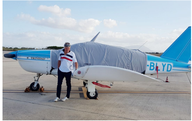
Socata Tampico, Tobago & Trinidad Travel Cover, Light Weight Canopy Cover