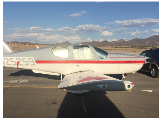
Socata TB-10 Cabin HeatShields