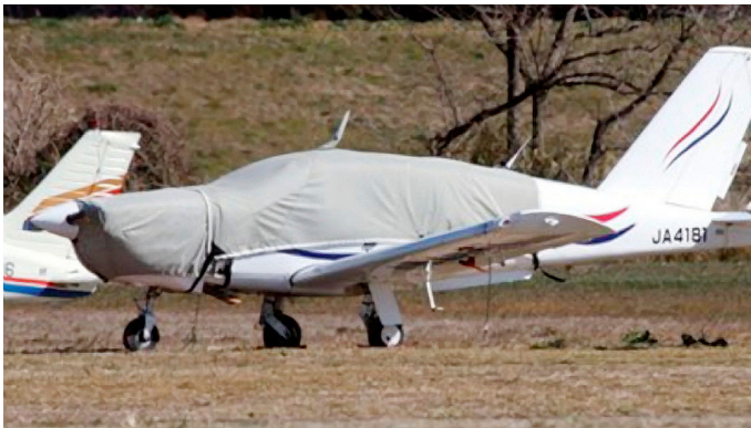
Canopy & Engine Covers

This cover type is made from Silver Acrylic Sunbrella canvas and is 100% lined with a soft and smooth microfiber. Bruce's Custom Covers developed this material combination especially for aircraft protection. The outer material is medium weight and treated for water resistance, UV resistance and anti-static buildup. The inner lining is a very soft and smooth microfiber to prevent scratching. The material is very reflective, and tests show that the cabin interior temperature can be reduced to near-ambient temperature on the hottest of days. It is water, ice and snow repellent, yet breathable to allow moisture to escape from between the cover and the aircraft surface.