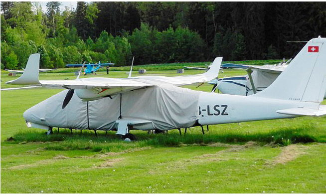
Tecnam Twin Extended Canopy/Nose Cover