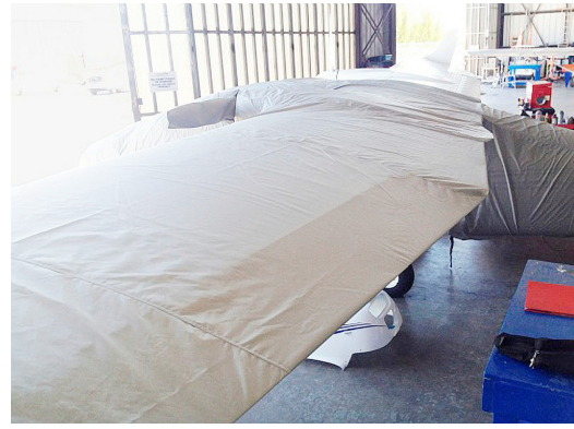
Tecnam Twin Canopy/Nose, Empennage, Wing/Engine, & Propellor/Spinner Covers