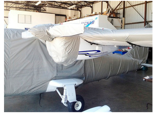
Tecnam Twin Canopy/Nose, Empennage, Wing/Engine, & Propellor/Spinner Covers