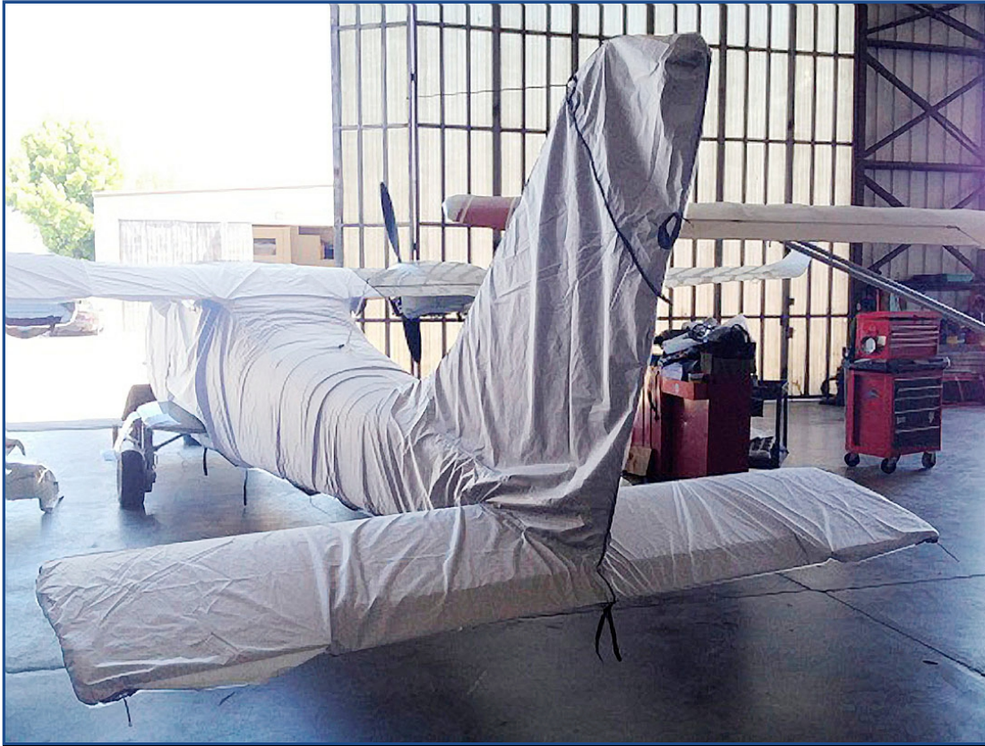
Tecnam Twin Canopy/Nose, Empennage, Wing/Engine, &amp; Propellor/Spinner Covers