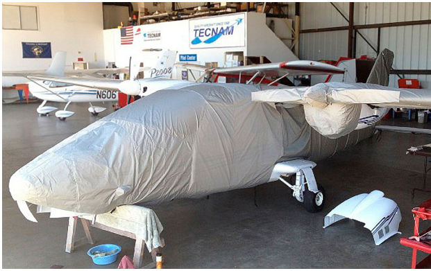
Tecnam Twin Canopy/Nose, Empennage, Wing/Engine, & Propellor/Spinner Covers