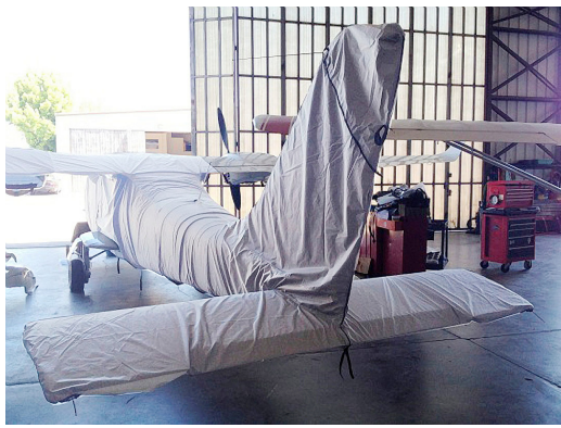
Tecnam Twin Canopy/Nose, Empennage, Wing/Engine, & Propellor/Spinner Covers