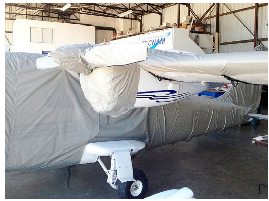
Tecnam Twin Canopy/Nose, Empennage, Wing/Engine, & Propellor/Spinner Covers