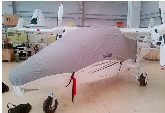
Tecnam P2006T Twin Lightweight Travel Canopy/Nose Cover

Travel Covers are made with Silver Solution-Dyed Polyester fabric and only lined over the windshield to save weight. The material is lightweight and more compact for easy stowage in the aircraft. The polyester material is water resistant, but only intended for occasional use outside. We also have an ultra lightweight material available for fitted hangar dust covers. For daily outdoor use, the non-travel Sunbrella Cover is the best choice.