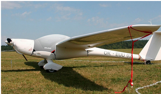
Lambda Canopy Cover (illustration)