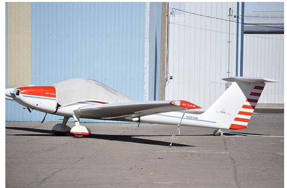
Grob 109 Canopy Cover