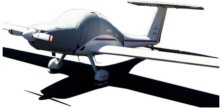
Grob 109 Canopy/Engine Cover & Horiz. Stabilizer Cover