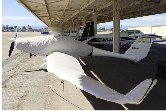
Phoenix Air U-15 Canopy/Engine, Wing & Horizontal Stabilizer Covers