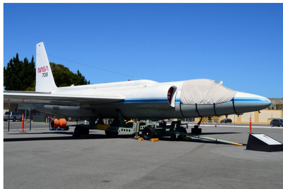
Lockheed U-2 Cockpit Cover