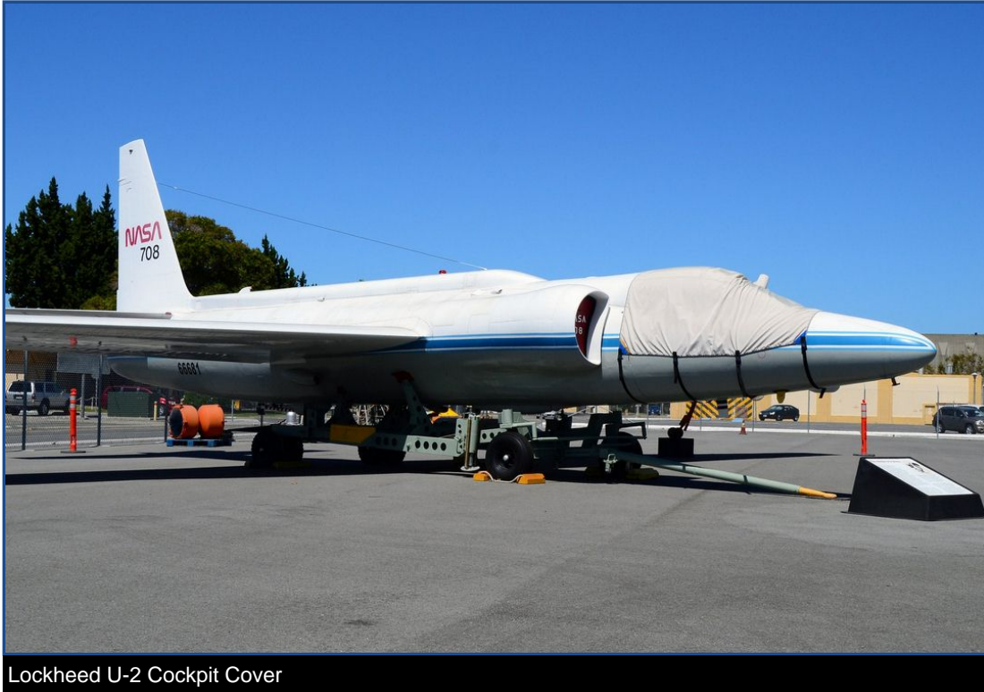
Lockheed U-2 Cockpit Cover