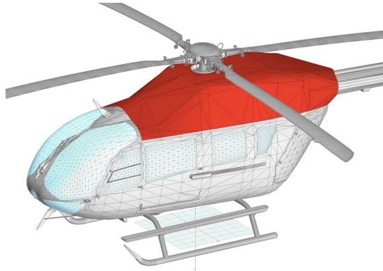
Intake/Exhaust Engine Area Cover, 3D Rendering

The Engine Inlet Plugs are custom fit for your Eurocopter UH-72 (EC-145) intakes, made with heavy-duty vinyl material, and stuffed with a single block of sculpted urethane foam. Each plug has a zipper that allows the foam to be removed and dried if necessary. Engine plugs have 'Remove Before Flight' streamers sewn onto the face of the plugs. Most plugs are imprinted with the aircraft registration number in black for an extra charge. Storage bag NOT included. Engine plugs may be inserted after flight when the engine is still warm. Engine Inlet Plugs are commonly referred to as Cowl Plugs, Intake Plugs, Cowl Blocks, Engine Blocks, and Engine Bungs.