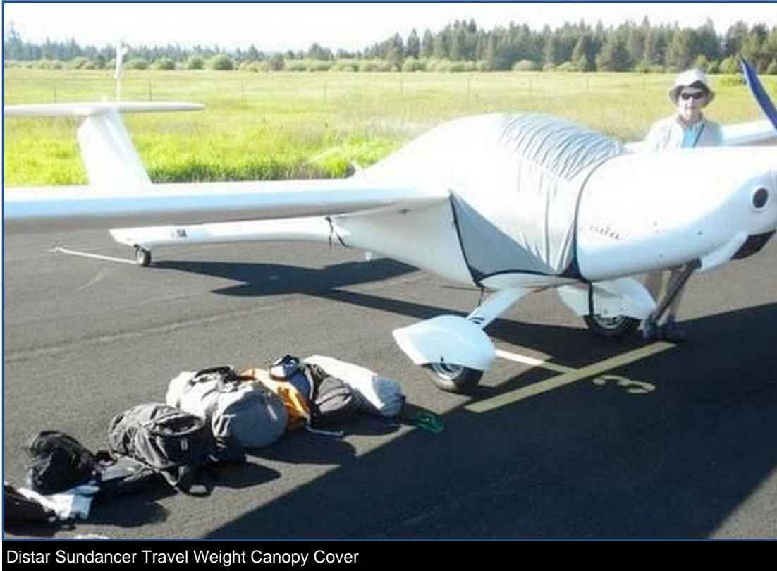
Distar Sundancer Travel Weight Canopy Cover