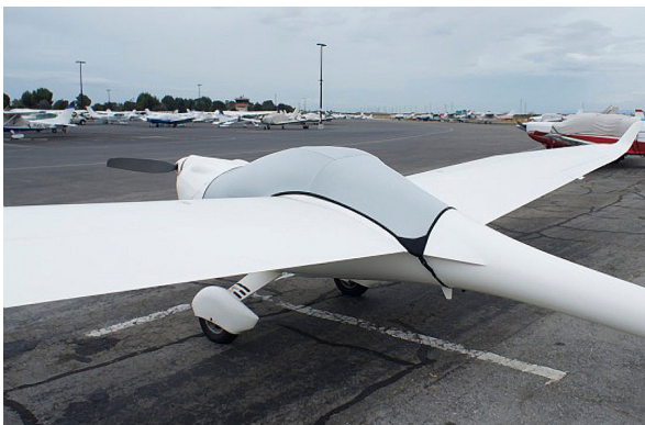
Lambada Canopy/Engine Cover and Wing Covers