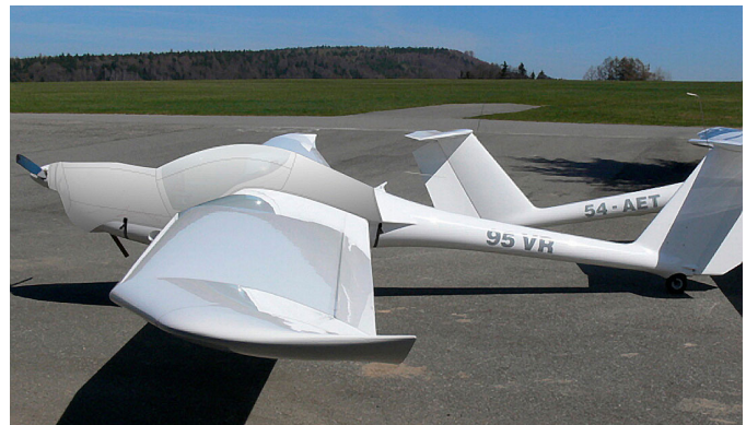
Lambda Canopy/Engine Cover (illustration)