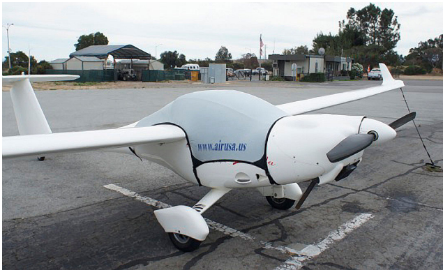
Lambda Travel Canopy Cover