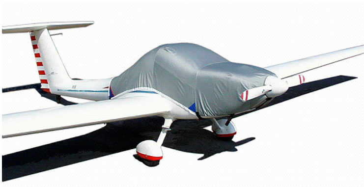
Grob 109 Canopy/Engine Cover