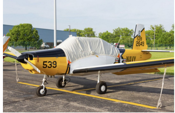
Varga Kachina Canopy Cover