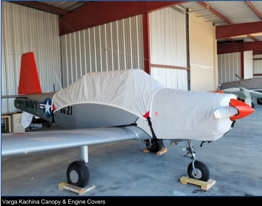
Varga Kachina Canopy &amp; Engine Covers