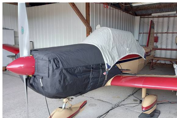
Varga 2150A Insulated Engine Cover, Canopy Cover