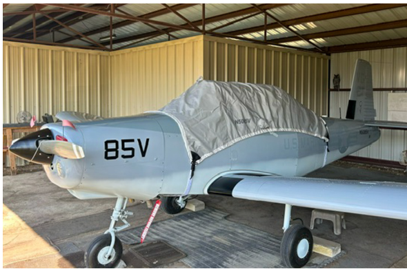
Varga Kachina Travel Cover, Light Weight Canopy Cover

Travel Covers are made with Silver Solution-Dyed Polyester fabric and only lined over the windshield to save weight. The material is lightweight and more compact for easy stowage in the aircraft. The polyester material is water resistant, but only intended for occasional use outside. We also have an ultra lightweight material available for fitted hangar dust covers. For daily outdoor use, the non-travel Sunbrella Cover is the best choice.