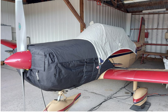
Varga 2150A Insulated Engine Cover, Canopy Cover

This cover type is made from Silver Acrylic Sunbrella canvas and is 100% lined with a soft and smooth microfiber. Bruce's Custom Covers developed this material combination especially for aircraft protection. The outer material is medium weight and treated for water resistance, UV resistance and anti-static buildup. The inner lining is a very soft and smooth microfiber to prevent scratching. The material is very reflective, and tests show that the cabin interior temperature can be reduced to near-ambient temperature on the hottest of days. It is water, ice and snow repellent, yet breathable to allow moisture to escape from between the cover and the aircraft surface.