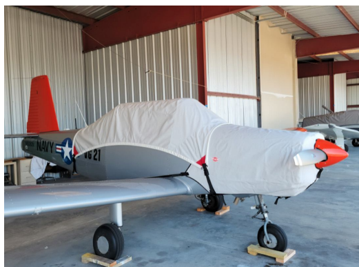
Varga Kachina Canopy & Engine Covers

This cover type is made from Silver Acrylic Sunbrella canvas and is 100% lined with a soft and smooth microfiber. Bruce's Custom Covers developed this material combination especially for aircraft protection. The outer material is medium weight and treated for water resistance, UV resistance and anti-static buildup. The inner lining is a very soft and smooth microfiber to prevent scratching. The material is very reflective, and tests show that the cabin interior temperature can be reduced to near-ambient temperature on the hottest of days. It is water, ice and snow repellent, yet breathable to allow moisture to escape from between the cover and the aircraft surface.