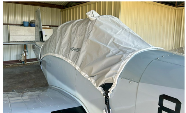
Varga Kachina Travel Cover, Light Weight Canopy Cover