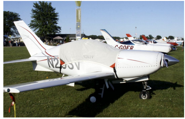
Questair Venture Canopy Cover