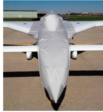
Long EZ Canopy/Nose/Engine Cover w/ Wing Extensions