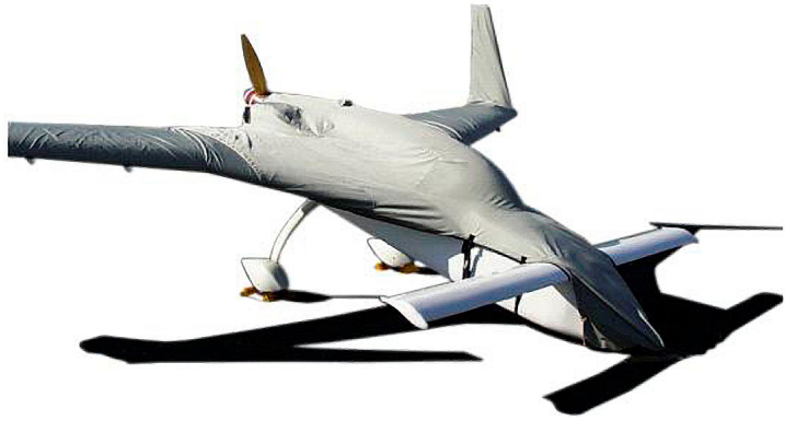
Long-EZ Canopy/Engine and Wing Covers