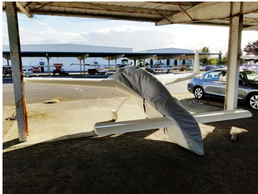
Rutan Vari EZ Travel Cover/Nose/Engine Cover