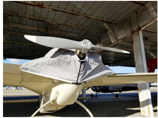
Rutan Vari EZ Travel Cover/Nose/Engine Cover