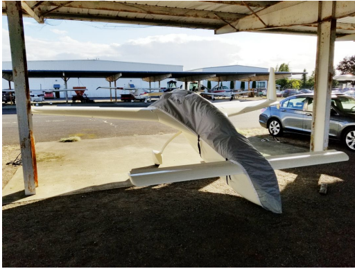
Rutan Vari EZ Travel Cover/Nose/Engine Cover