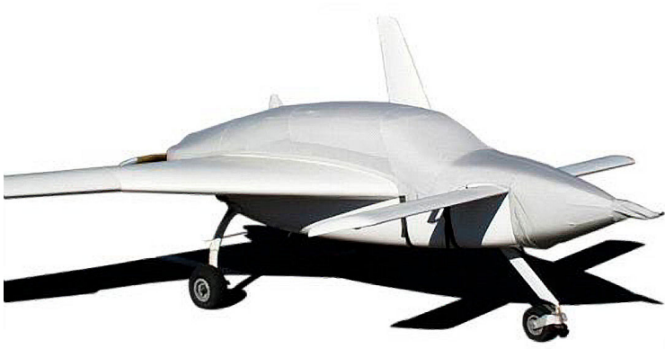
Velocity Canopy/Nose/Engine Cover