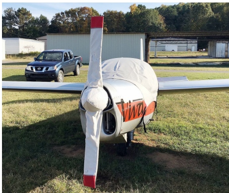
Aerotechnik L-13 Vivat Motorglider Prop/Spinner & Canopy Covers