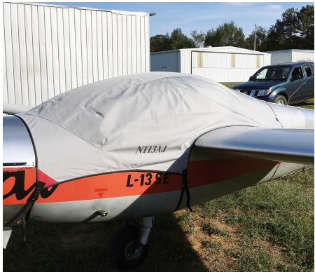
Aerotechnik L-13 Travel Cover