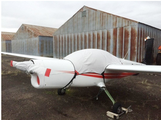
Vivat Canopy and Prop/Spinner Cover