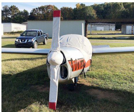
Aerotechnik L-13 Vivat Motorglider Prop/Spinner & Canopy Covers