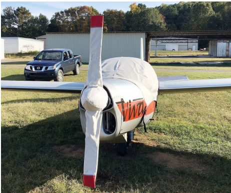
Aerotechnik L-13 Vivat Motorglider Prop/Spinner & Canopy Covers