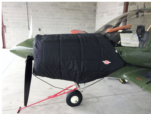
Scottish Aviation Bulldog Insulated Engine Cover

This cover type is made from Silver Acrylic Sunbrella canvas and is 100% lined with a soft and smooth microfiber. Bruce's Custom Covers developed this material combination especially for aircraft protection. The outer material is medium weight and treated for water resistance, UV resistance and anti-static buildup. The inner lining is a very soft and smooth microfiber to prevent scratching. The material is very reflective, and tests show that the cabin interior temperature can be reduced to near-ambient temperature on the hottest of days. It is water, ice and snow repellent, yet breathable to allow moisture to escape from between the cover and the aircraft surface.