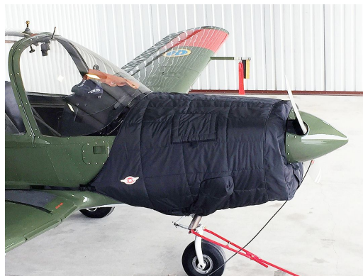
Scottish Aviation Bulldog Insulated Engine Cover