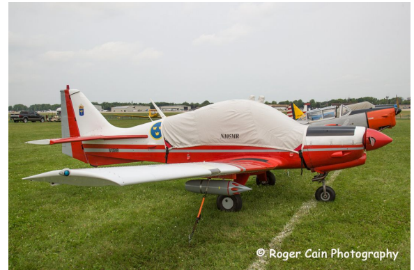
Scottish Aviation Bulldog Canopy Cover