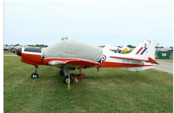
Scottish Aviation Bulldog Canopy Cover