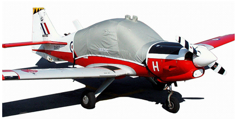
Scottish Aviation Bulldog Canopy Cover

Travel Covers are made with Silver Solution-Dyed Polyester fabric and only lined over the windshield to save weight. The material is lightweight and more compact for easy stowage in the aircraft. The polyester material is water resistant, but only intended for occasional use outside. We also have an ultra lightweight material available for fitted hangar dust covers. For daily outdoor use, the non-travel Sunbrella Cover is the best choice.