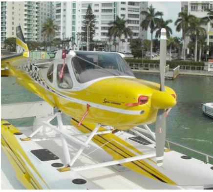
Glstar Engine Plugs