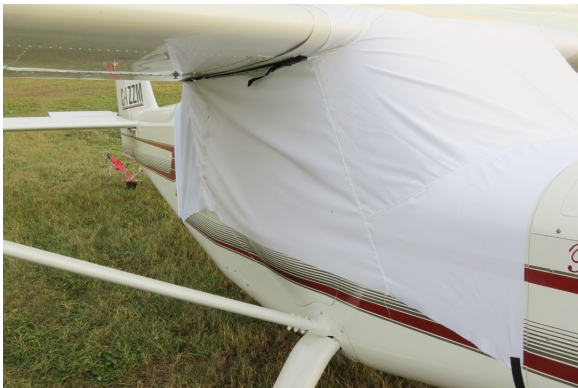
Pelican Canopy Cover (test fit cover)

This cover type is made from Silver Acrylic Sunbrella canvas and is 100% lined with a soft and smooth microfiber. Bruce's Custom Covers developed this material combination especially for aircraft protection. The outer material is medium weight and treated for water resistance, UV resistance and anti-static buildup. The inner lining is a very soft and smooth microfiber to prevent scratching. The material is very reflective, and tests show that the cabin interior temperature can be reduced to near-ambient temperature on the hottest of days. It is water, ice and snow repellent, yet breathable to allow moisture to escape from between the cover and the aircraft surface.