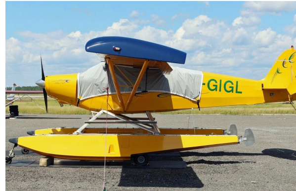
Wag Aero Sportsman 2+2 Canopy Cover