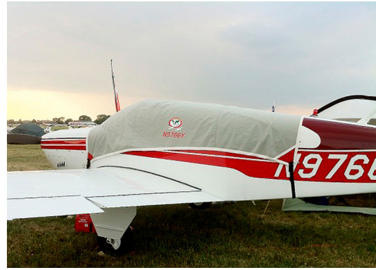
Beech Bonanza Canopy Cover with Commemorative B2Osh logo