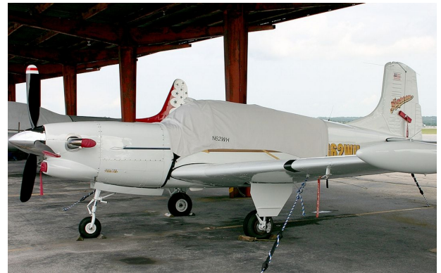
Beech Harpoon Canopy Cover, Exhaust Covers, Engine Plug