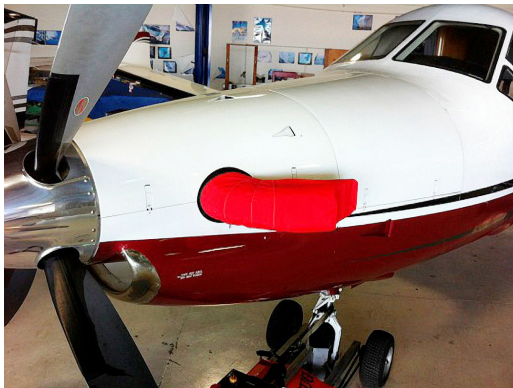
Pilatus PC-12 Exhaust Cover, Fully Enclosed, for protection against corrosion.

Prop Tie-Down/Exhaust Covers are made of heavy duty red vinyl material. Thick nylon webbing runs from the exhaust covers to the prop boot. This webbing is adjustable with plastic buckles, and is held tight with a steel spring where it attaches to the prop boot.