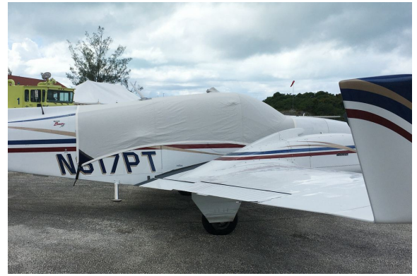
Beech Baron 58 Canopy Cover