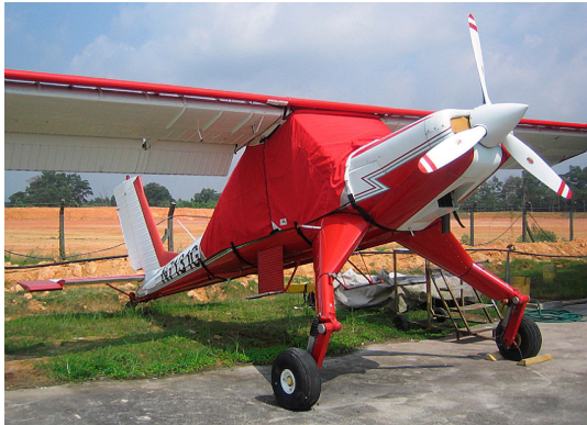
Wilga Canopy Cover