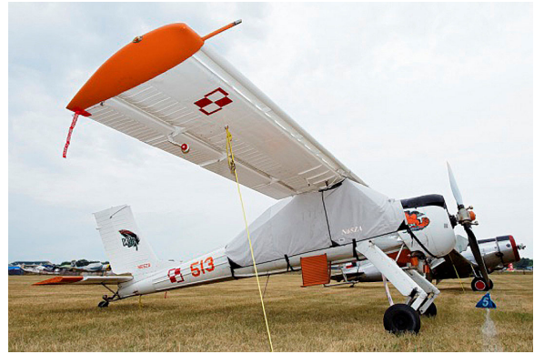
Wilga Canopy Cover