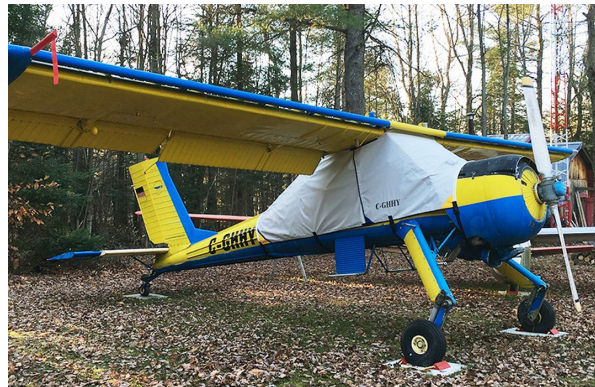
PZL-104-35 WILGA CANOPY COVER

PZL Wilga Pitot Tube Covers , NOT HEAT RESISTANT TYPE, are made of Naugahyde vinyl, and are designed to cover the entire pitot assembly. Slipping over the tube, the cover tightens around the base with a Velcro strap detail. A "Remove Before Flight" streamer is attached to the cover. Heat Resistant Pitot Covers are an upgrade to this design, and help prevent the pitot cover from melting onto the tube if the pitot heat is accidentally turned on while installed. If you want the set tethered together, please let us know.