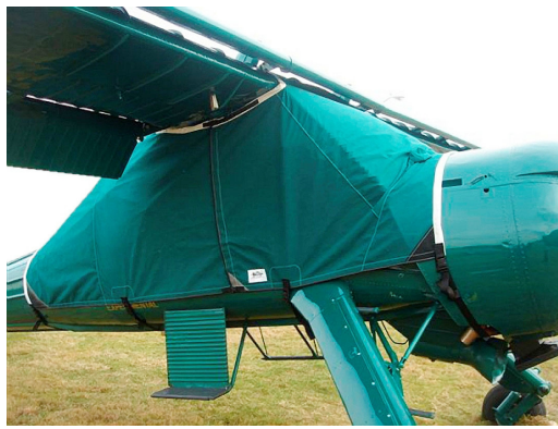
Wilga Canopy Cover