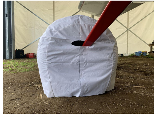
Cub Crafters CC19 Oversize Tire Covers, test fit cover