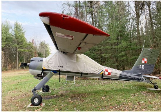
PZL Wilga Canopy Cover, Wrap-Around Type

water resistance, UV resistance and anti-static buildup. The inner lining is a very soft and smooth microfiber to prevent scratching. The material is very reflective, and tests show that the cabin interior temperature can be reduced to near-ambient temperature on the hottest of days. It is water, ice and snow repellent, yet breathable to allow moisture to escape from between the cover and the aircraft surface.