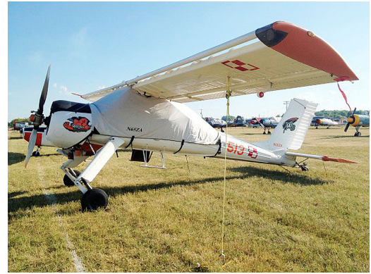
Wilga Canopy Cover