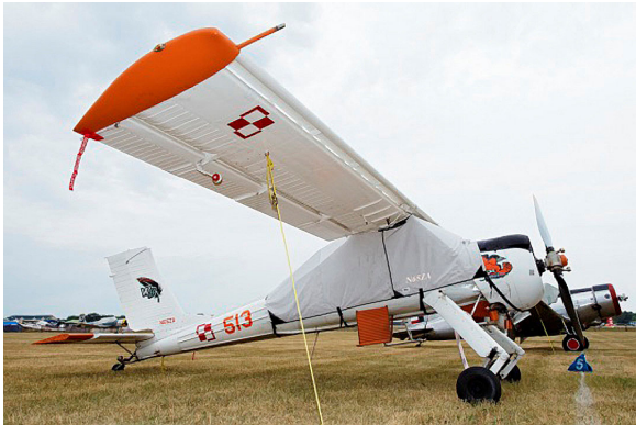
Wilga Canopy Cover

water resistance, UV resistance and anti-static buildup. The inner lining is a very soft and smooth microfiber to prevent scratching. The material is very reflective, and tests show that the cabin interior temperature can be reduced to near-ambient temperature on the hottest of days. It is water, ice and snow repellent, yet breathable to allow moisture to escape from between the cover and the aircraft surface.