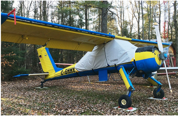
PZL-104-35 WILGA CANOPY COVER

water resistance, UV resistance and anti-static buildup. The inner lining is a very soft and smooth microfiber to prevent scratching. The material is very reflective, and tests show that the cabin interior temperature can be reduced to near-ambient temperature on the hottest of days. It is water, ice and snow repellent, yet breathable to allow moisture to escape from between the cover and the aircraft surface.