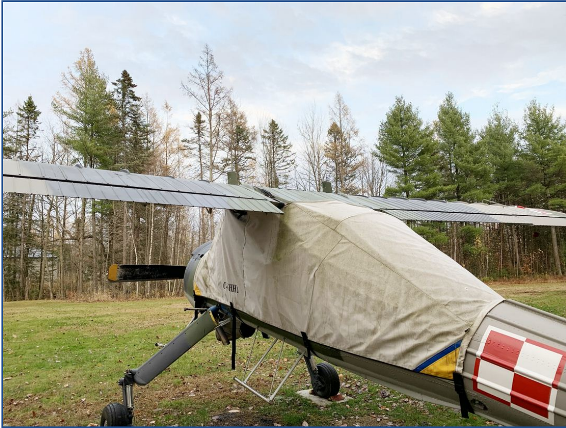
PZL Wilga Canopy Cover, Wrap-Around Type