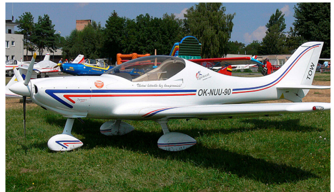
Covers, Plugs & HeatShields for Dynamic WT9