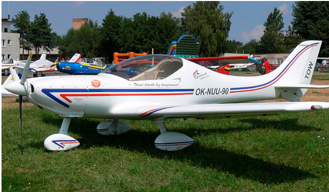
Covers, Plugs & HeatShields for Dynamic WT9

This cover type is made from Silver Acrylic Sunbrella canvas and is 100% lined with a soft and smooth microfiber. Bruce's Custom Covers developed this material combination especially for aircraft protection. The outer material is medium weight and treated for water resistance, UV resistance and anti-static buildup. The inner lining is a very soft and smooth microfiber to prevent scratching. The material is very reflective, and tests show that the cabin interior temperature can be reduced to near-ambient temperature on the hottest of days. It is water, ice and snow repellent, yet breathable to allow moisture to escape from between the cover and the aircraft surface.