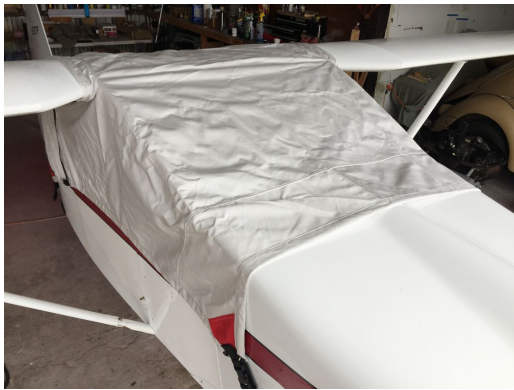
Wittman Tailwind Canopy Cover, Over-The-Top

This cover type is made from Silver Acrylic Sunbrella canvas and is 100% lined with a soft and smooth microfiber. Bruce's Custom Covers developed this material combination especially for aircraft protection. The outer material is medium weight and treated for water resistance, UV resistance and anti-static buildup. The inner lining is a very soft and smooth microfiber to prevent scratching. The material is very reflective, and tests show that the cabin interior temperature can be reduced to near-ambient temperature on the hottest of days. It is water, ice and snow repellent, yet breathable to allow moisture to escape from between the cover and the aircraft surface.