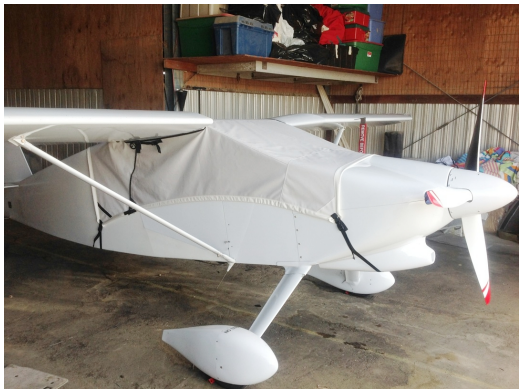
Wittman Tailwind Canopy Cover

This cover type is made from Silver Acrylic Sunbrella canvas and is 100% lined with a soft and smooth microfiber. Bruce's Custom Covers developed this material combination especially for aircraft protection. The outer material is medium weight and treated for water resistance, UV resistance and anti-static buildup. The inner lining is a very soft and smooth microfiber to prevent scratching. The material is very reflective, and tests show that the cabin interior temperature can be reduced to near-ambient temperature on the hottest of days. It is water, ice and snow repellent, yet breathable to allow moisture to escape from between the cover and the aircraft surface.