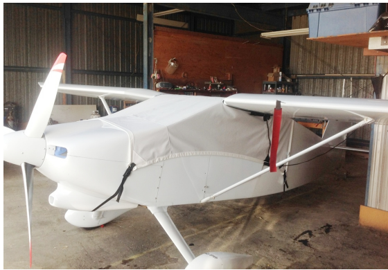
Wittman Tailwind Canopy Cover