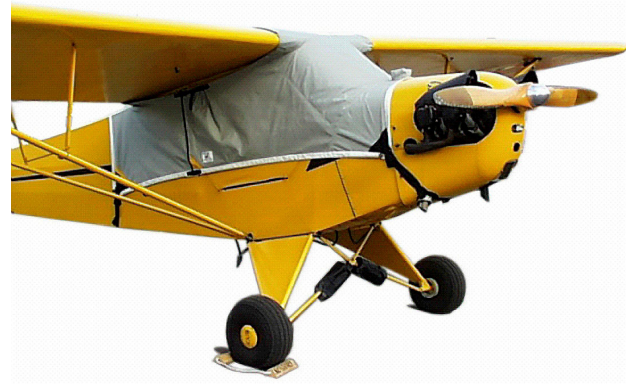
Piper J3 Canopy Cover