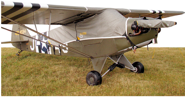
Piper J3 Extended Canopy Cover & Propellor Cover