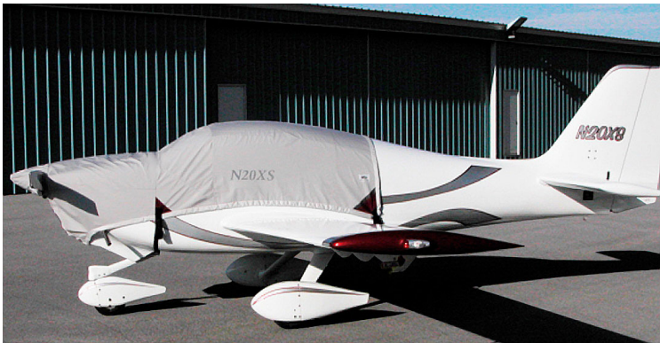
Canopy/Engine and Prop/Spinner Covers (tri-gear model)