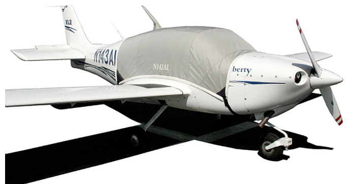
XL-2 Canopy Cover