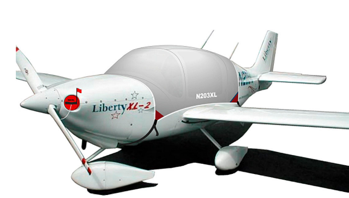
XL-2 Canopy Cover & Engine Plugs (Illustration)

This cover type is made from Silver Acrylic Sunbrella canvas and is 100% lined with a soft and smooth microfiber. Bruce's Custom Covers developed this material combination especially for aircraft protection. The outer material is medium weight and treated for water resistance, UV resistance and anti-static buildup. The inner lining is a very soft and smooth microfiber to prevent scratching. The material is very reflective, and tests show that the cabin interior temperature can be reduced to near-ambient temperature on the hottest of days. It is water, ice and snow repellent, yet breathable to allow moisture to escape from between the cover and the aircraft surface.