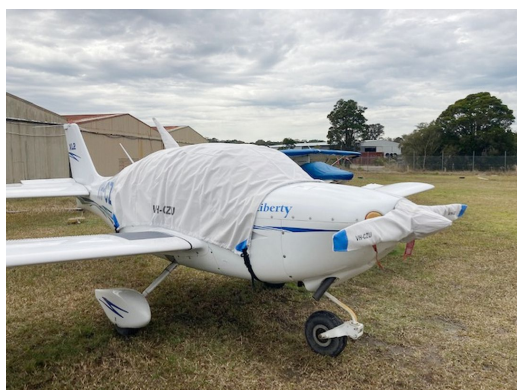
XL-2 CANOPY COVER

This cover type is made from Silver Acrylic Sunbrella canvas and is 100% lined with a soft and smooth microfiber. Bruce's Custom Covers developed this material combination especially for aircraft protection. The outer material is medium weight and treated for water resistance, UV resistance and anti-static buildup. The inner lining is a very soft and smooth microfiber to prevent scratching. The material is very reflective, and tests show that the cabin interior temperature can be reduced to near-ambient temperature on the hottest of days. It is water, ice and snow repellent, yet breathable to allow moisture to escape from between the cover and the aircraft surface.