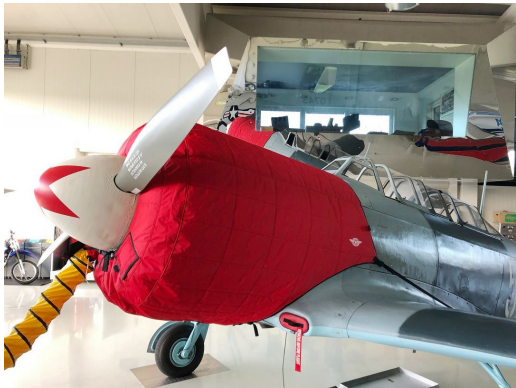
Yak 11 Insulated Engine Cover & Oil Cooler Inlet Plug

Engine Inlet Plugs are custom fit for your Yakovlev Yak 11 intakes, made with heavy-duty vinyl material, and stuffed with a single block of sculpted urethane foam. Each plug has a zipper that allows the foam to be removed and dried if necessary. Engine plugs have warning flags that are visible from the cockpit or 'remove before flight' streamers sewn onto the face of the plugs. Most plugs are imprinted with the aircraft registration number in black for an extra charge. Storage bag NOT included. Engine plugs may be inserted after flight when the engine is still warm. Engine Inlet Plugs are commonly referred to as Cowl Plugs, Intake Plugs, Cowl Blocks, Engine Blocks, and Engine Bungs.