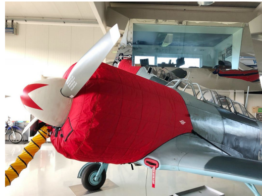
Yak 11 Insulated Engine Cover & Oil Cooler Inlet Plug