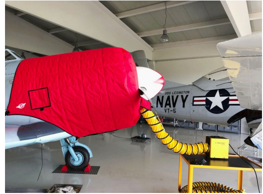
Yak 11 Insulated Engine Cover