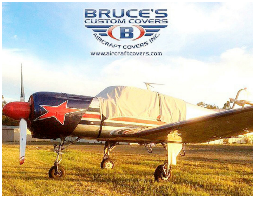
Yak 18 Canopy Cover