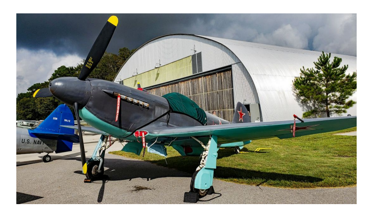
Yakovlev Yak 3 Oil Cooler Inlet Plugs (In Wing Root)