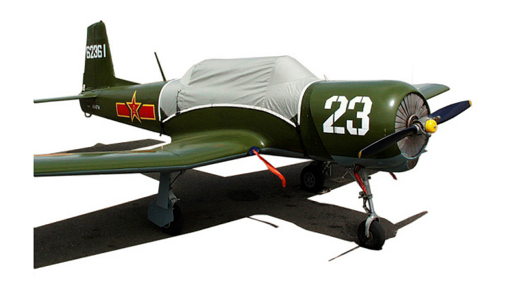
CJ-6 Nanchang Canopy Cover