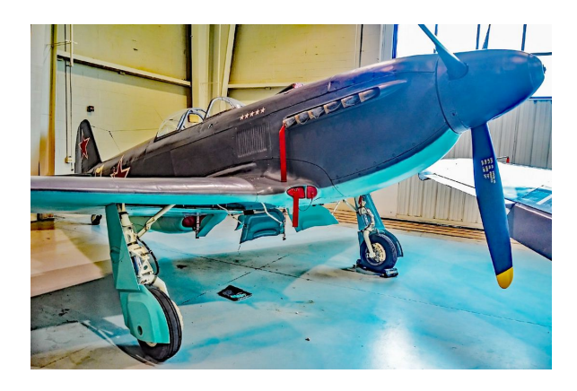
Yakovlev Yak 3 Oil Cooler Inlet Plugs (In Wing Root), Belly Scoop Plug

Engine Inlet Plugs are custom fit for your Yakovlev Yak 3 intakes, made with heavy-duty vinyl material, and stuffed with a single block of sculpted urethane foam. Each plug has a zipper that allows the foam to be removed and dried if necessary. Engine plugs have warning flags that are visible from the cockpit or 'remove before flight' streamers sewn onto the face of the plugs. Most plugs are imprinted with the aircraft registration number in black for an extra charge. Storage bag NOT included. Engine plugs may be inserted after flight when the engine is still warm. Engine Inlet Plugs are commonly referred to as Cowl Plugs, Intake Plugs, Cowl Blocks, Engine Blocks, and Engine Bungs.