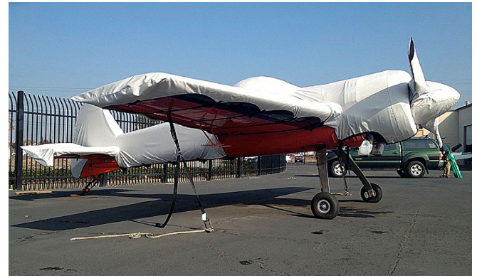
Yak 55 Full Fuselage Cover w/ Detachable Wing Covers & Propellor/Spinner Cover