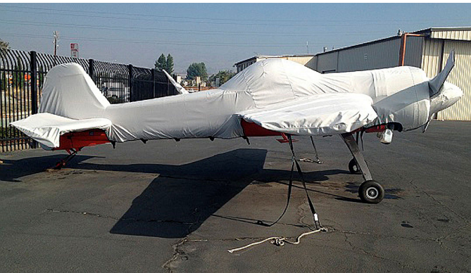
Yak 55 Full Fuselage Cover w/ Detachable Wing Covers & Propellor/Spinner Cover