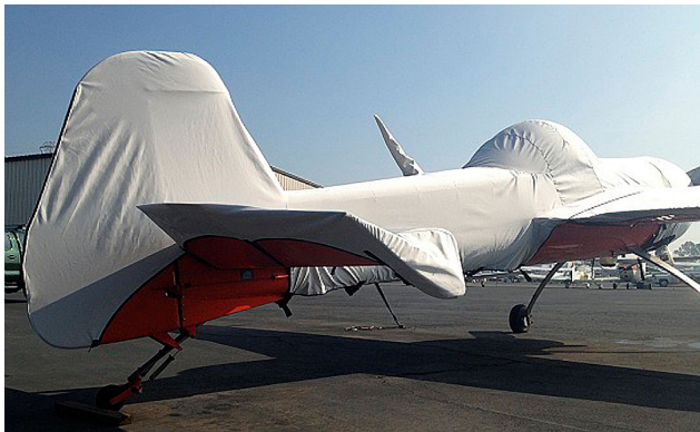
Yak 55 Full Fuselage Cover w/ Detachable Wing Covers & Propellor/Spinner Cover