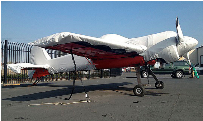
Yak 55 Full Fuselage Cover w/ Detachable Wing Covers & Propellor/Spinner Cover

This cover type is made from Silver Acrylic Sunbrella canvas and is 100% lined with a soft and smooth microfiber. Bruce's Custom Covers developed this material combination especially for aircraft protection. The outer material is medium weight and treated for water resistance, UV resistance and anti-static buildup. The inner lining is a very soft and smooth microfiber to prevent scratching. The material is very reflective, and tests show that the cabin interior temperature can be reduced to near-ambient temperature on the hottest of days. It is water, ice and snow repellent, yet breathable to allow moisture to escape from between the cover and the aircraft surface.