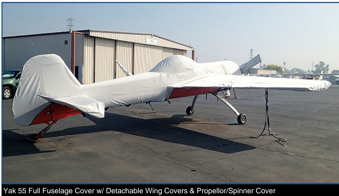
Yak 55 Full Fuselage Cover w/ Detachable Wing Covers &amp; Propellor/Spinner Cover